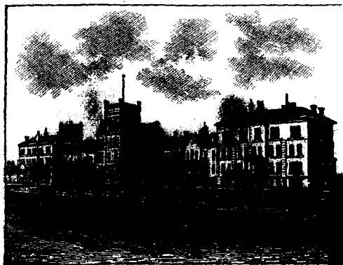
Minnesota School for the Feeble-Minded FARIBAULT.