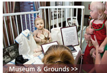
Museum & Grounds >>