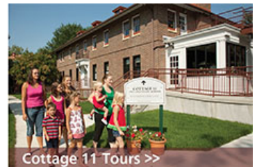
Cottage 11 Tours >>