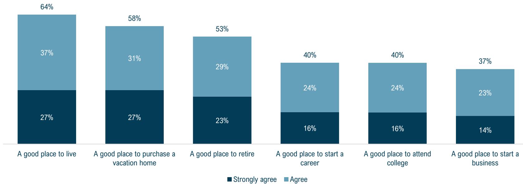
Overall Halo Effect All Non-Minnesota Residents