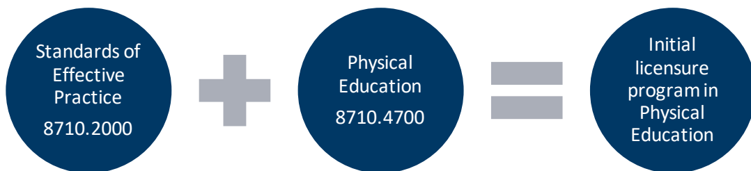
Figure 4: Licensure Standards included in an Initial Licensure Program in PE

Special education programs must include core skills standards that are applicable to each special education field respectively. Special education programs must include a core application (outlined in 8710.5000), as well as a disability specific application.