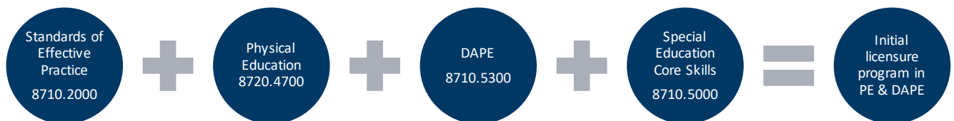
Figure 5: Licensure Standards included in a Dual Licensure Program in PE and DAPE

Special education programs must include core skills standards that are applicable to each special education field respectively. Special education programs must include a core application (outlined in 8710.5000), as well as a disability specific application.