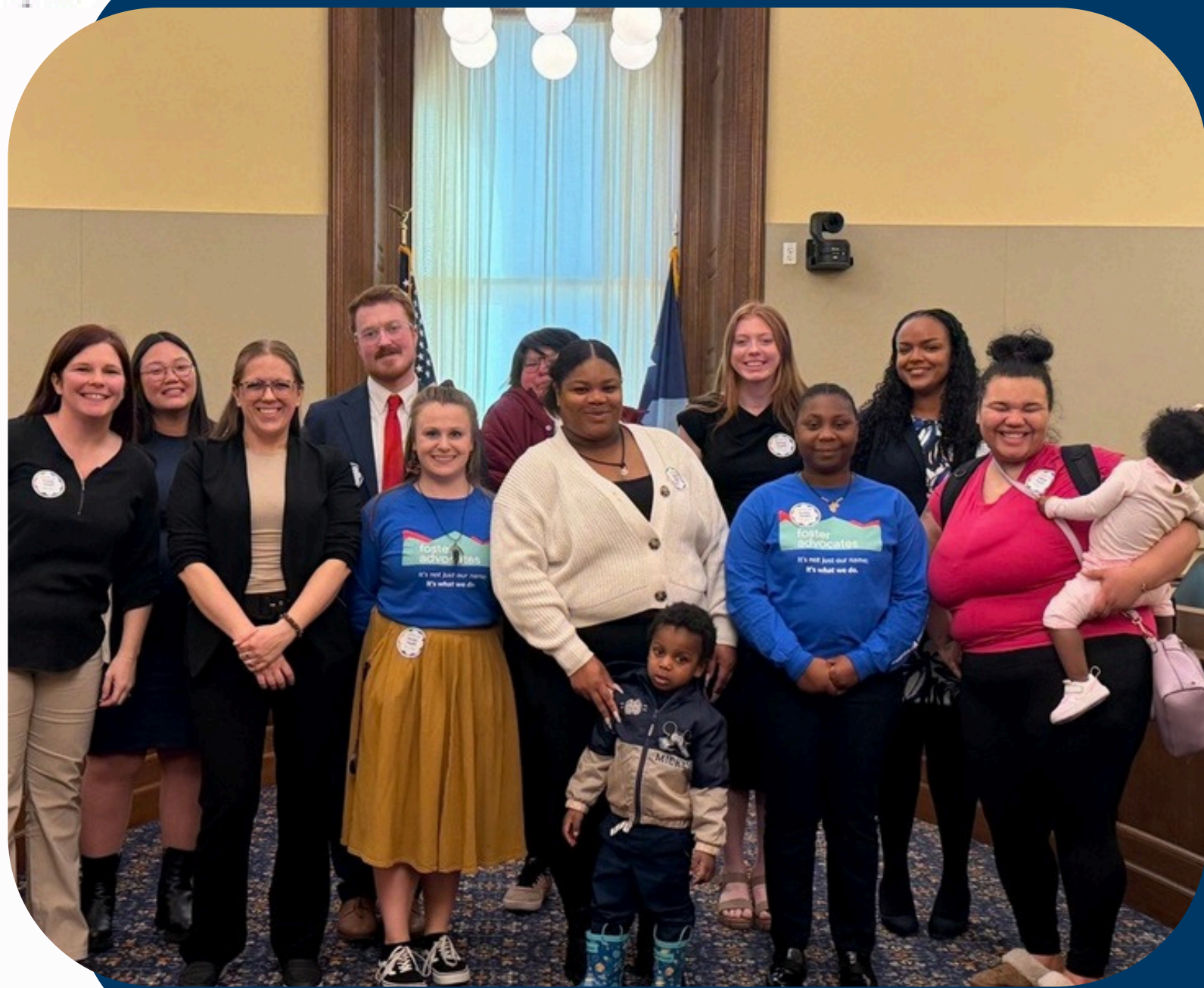
After the Children & Families hearing for FYBOR!