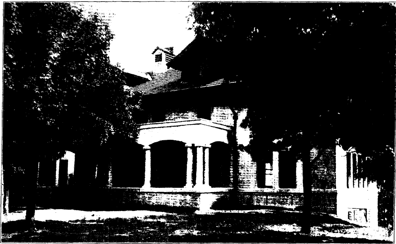
WORKING BOYS' COTTAGE, SCHOOL FOR FEEBLE-MINDED, FARIBAULT.