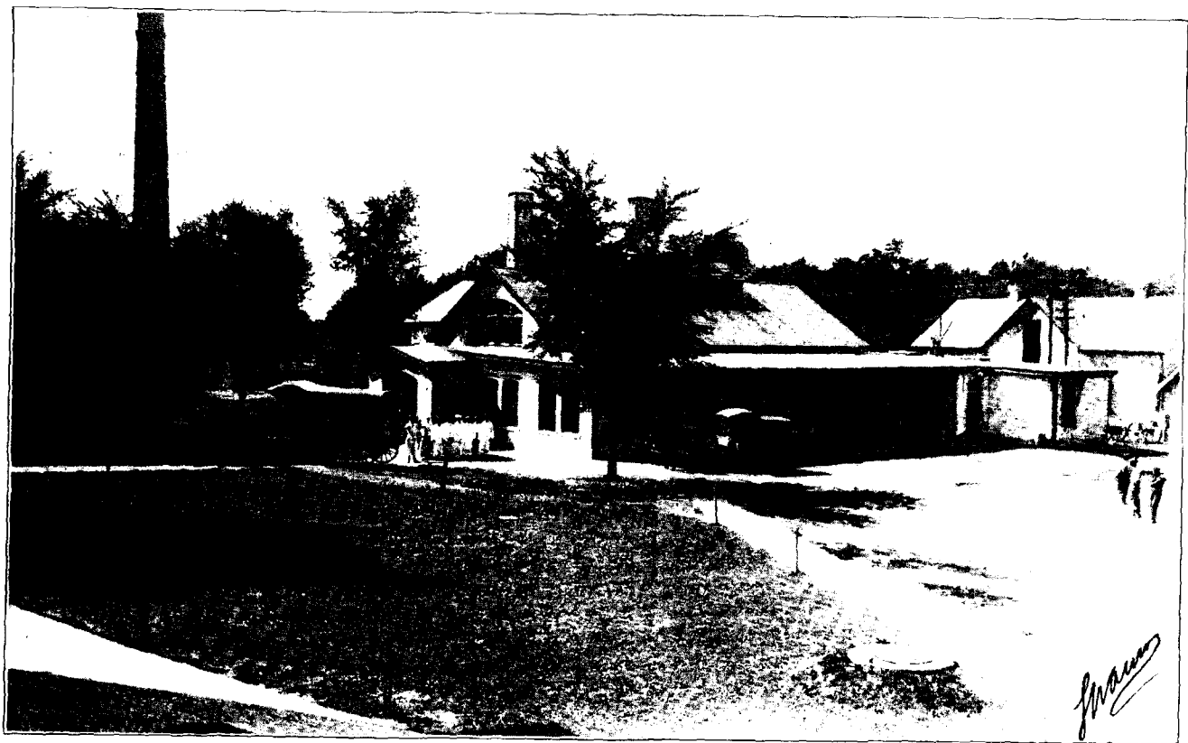
CENTRAL KITCHEN, SCHOOL FOR FEEBLE-MINDED, FARIBAULT.