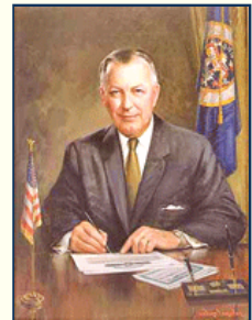
Gov. Elmer L. Andersen