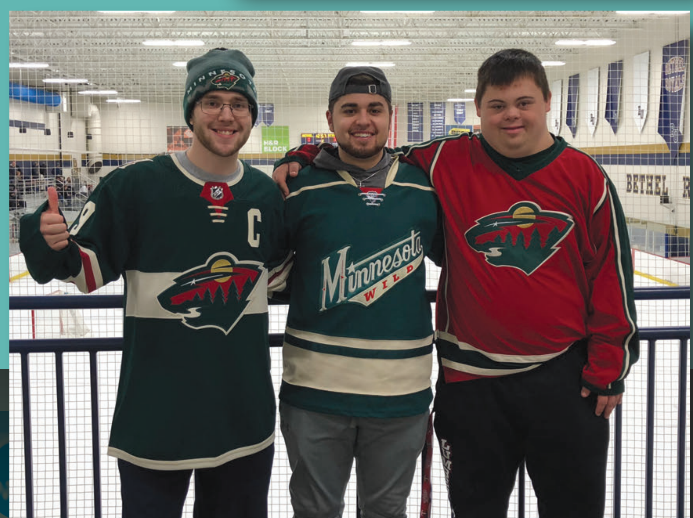
Above and background: Enjoying college experiences.