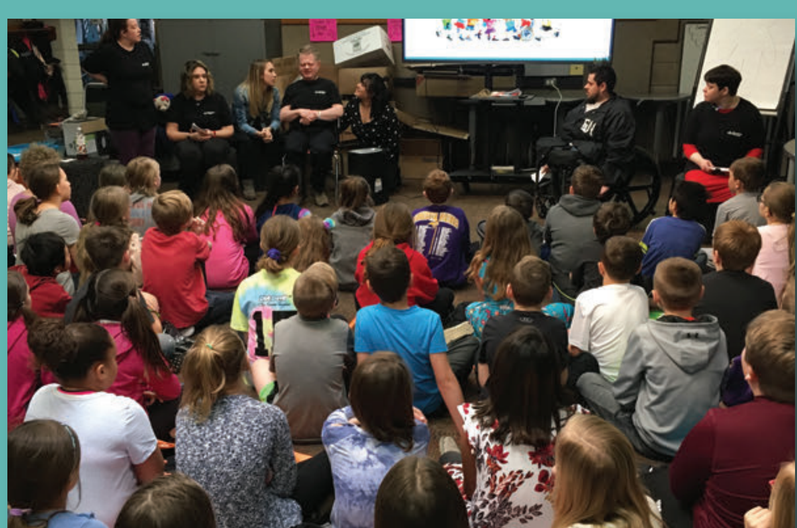
Below: Ambassadors for Respect presents to fourth graders at Otter Lake Elementary School, 2019.

In the past decade, greater opportunities for living, learning, working, and enjoying life in the community have been obtained for Minnesotans with developmental disabilities. Progress has been made in securing rights and exercising more choices, leading to a greater quality of life, independent living, and expanded employment opportunities that allow individual interests and preferences to be discovered. In schools, some children are being fully included in general education classes, preparing them for a future full of opportunities.