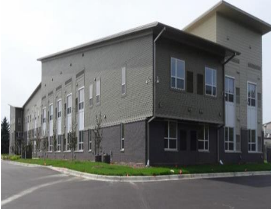
Gage East, Rochester - New construction Supportive housing for homeless individuals and families, 55 units