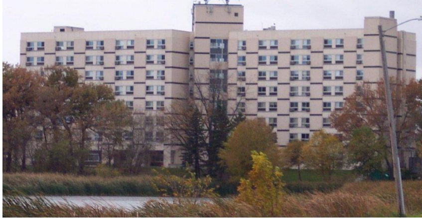
Lakeview Highrise, Willmar Preservation project to replace plumbing Publicly owned by Kandiyohi County Housing and Redevelopment Authority, 121 units