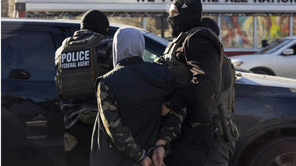
Federal immigration officers in Minnesota arrest someone during a deportation sweep in Minneapolis, Minnesota on Jan. 14.

"The Minnesota Department of Corrections honors all federal and local detainees, including those issued by U.S. Immigration and Customs Enforcement (ICE)," said the Minnesota DOC. "DHS's assertion that 1,360 non-U.S. citizens are in Minnesota's state custody is inexplicable. Minnesota's total state prison population is approximately 8,000 individuals, and only 207 (less than 3 percent) are non-U.S. citizens. Further, in 2025, 84 individuals with ICE detainers were released. In each case, ICE was notified in advance and DOC staff coordinated with ICE officials to facilitate the custody transfer when requested."