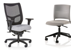
Seating and Upholstery