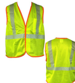
Garments & Contract Sewing