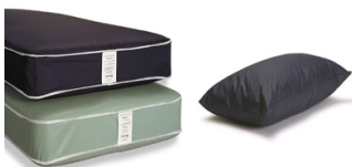
Mattresses and Pillows