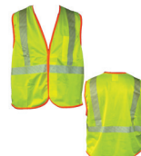
High Visibility Clothing