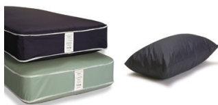
Mattresses and Pillows