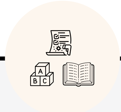
CHILD-FOCUSED WITH PARENT & CAREGIVER ELEMENTS

This could include early childhood development with parenting skills; family literacy with health screenings; and/or other child-focused services that also identify ways to support the adults in their lives.