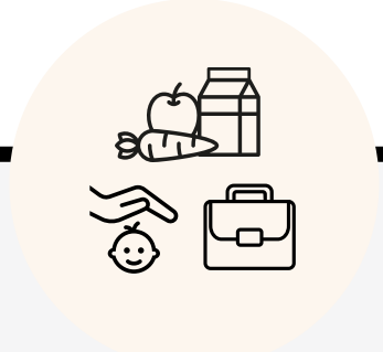
PARENT- & CAREGIVER- FOCUSED WITH CHILD ELEMENTS

Two-generation (2Gen) approaches build family well-being by intentionally and simultaneously working with children and the adults in their lives together.