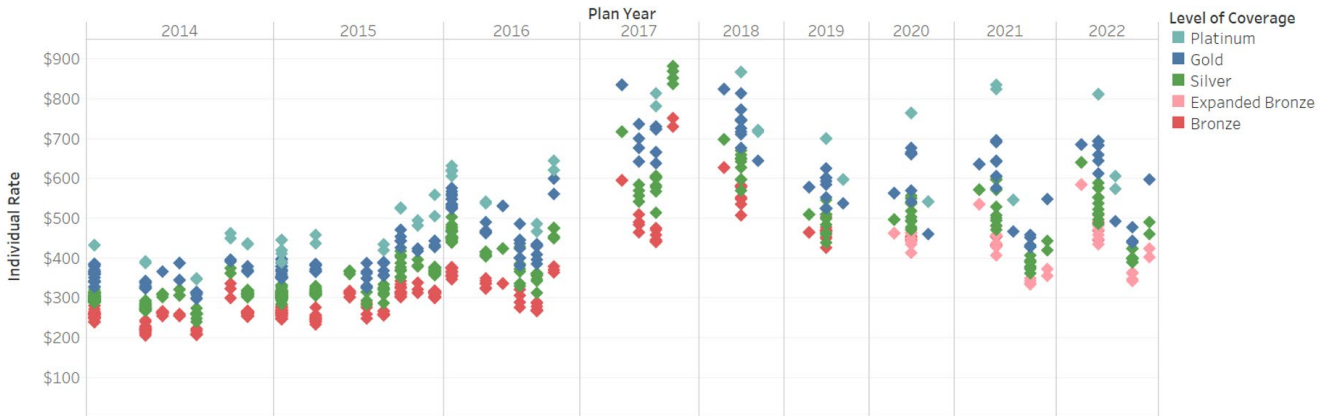
2014 - 2021 Final Rates to 2022 Individual Market Rates With Reinsurance All Plans - Rating Area 1

2022 rates and enrollment data were used as a starting point to model the average premiums and second-lowest silver price points for 2023. Table A-13 shows how those rates vary by metal level and area. 3