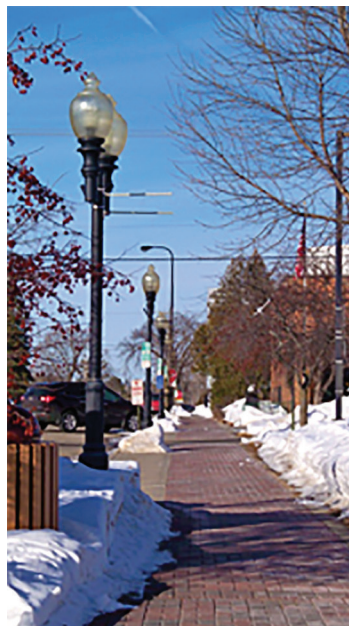
Street lights were retrofitted with LED kits citywide.

Three buildings—City Hall, Public Works, and the Sanford Center—received lighting retrofits, energy management system (EMS) and direct digital controls (DDC) recommissioning, and air leakage sealing; Public Works also had a cooling system upgrade. The Wastewater Treatment Facility, Chamber Building, and two liquor stores received lighting upgrades. The History Center had its existing DDC system recommissioned, while the Library received a lighting retrofit, DDC recommissioning, air leakage service, and two new hot water high-efficiency modulating boilers.