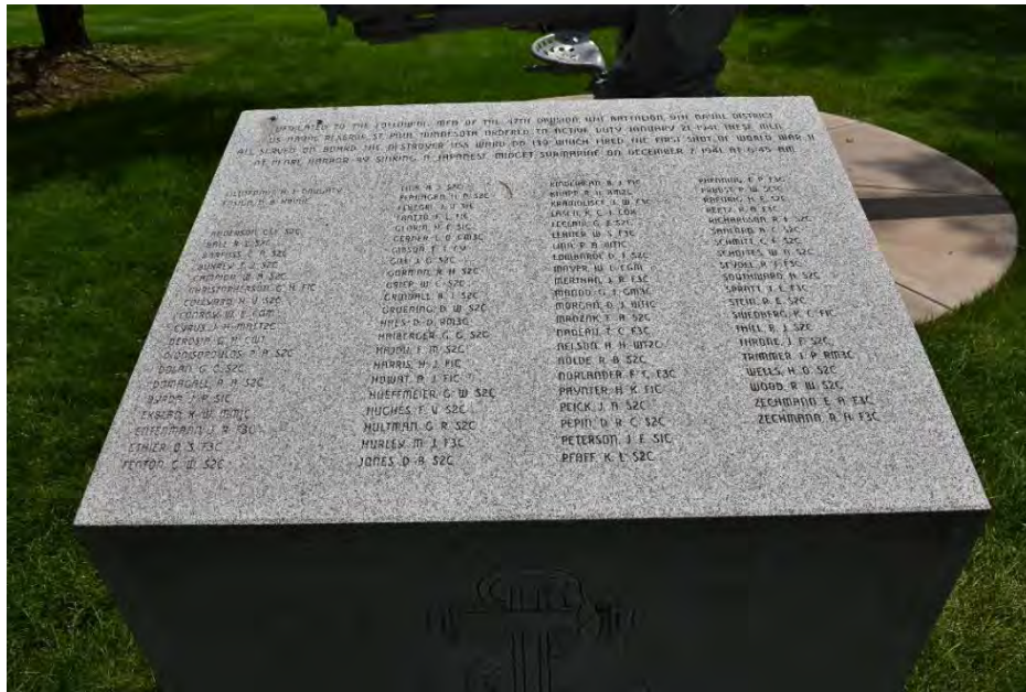
Figure 10 Image of the signage at the USS Ward Gun site at the State Capitol Mall listing 84 Reservists who served aboard the USS Ward (DD 139).

The top inscription reads “DEDICATED TO THE FOLLOWING MEN OF THE 47 TH DIVISION 11 TH BATTALION 9 TH NAVAL DISTRICT US NAVAL RESERVE. ST PAUL MINNESOTA ORDERED TO ACTIVE DUTY JANUARY 21, 1941. THESE MEN ALL SERVED ON BOARD THE DESTROYER USS WARD DD 139 WHICH FIRED THE FIRST SHOT OF THE WORLD WAR II AT PEARL HARBOR BY SINKING A JAPANESE MIDGET SUBMARINE ON DECEMBER 7, 1941 AT 6:45AM.”