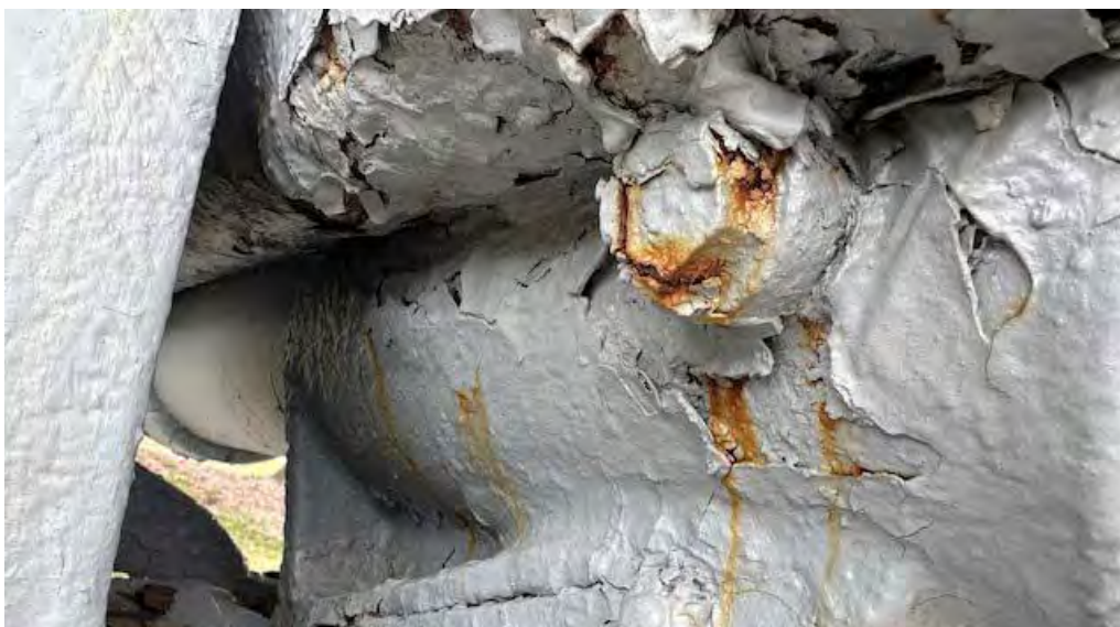
Figure 6 An image showing deterioration under the USS Ward Gun

Attachment 2: Application to Remove the USS Ward Gun from the State Capitol to MMVM