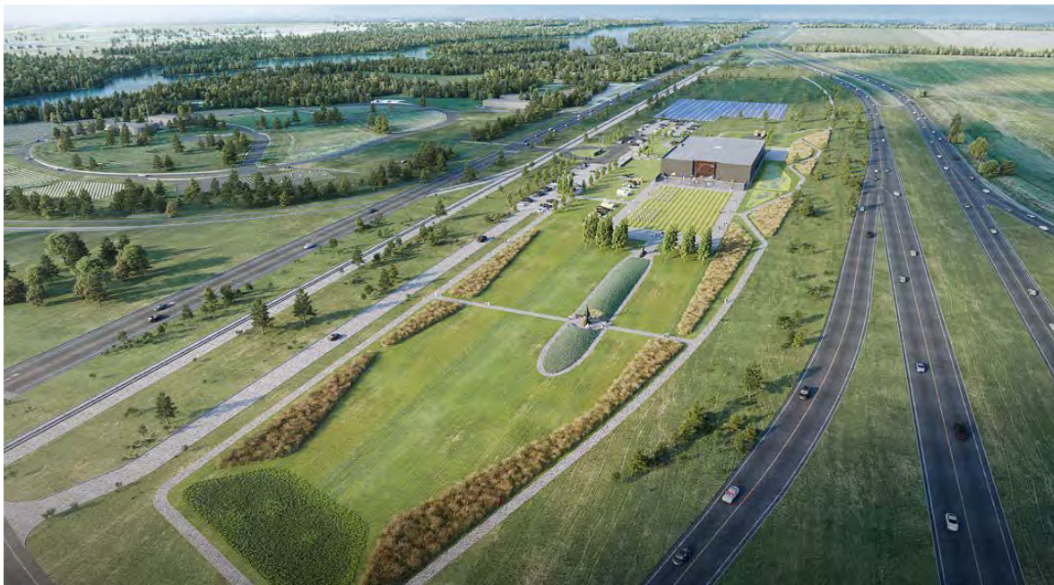
Figure 3 Exterior renderings showing the new Minnesota Military & Veterans Museum in Camp Ripley

In 2023, the Minnesota State Legislature allocated funds to the Minnesota Department of Military Affairs for the construction of a new 40,000 square foot Military and Veterans Museum on 32-acres at Camp Ripley. The new facility, to open in 2026, will replace a very modest museum at Camp Ripley that has served veterans and their families for more than 40 years.