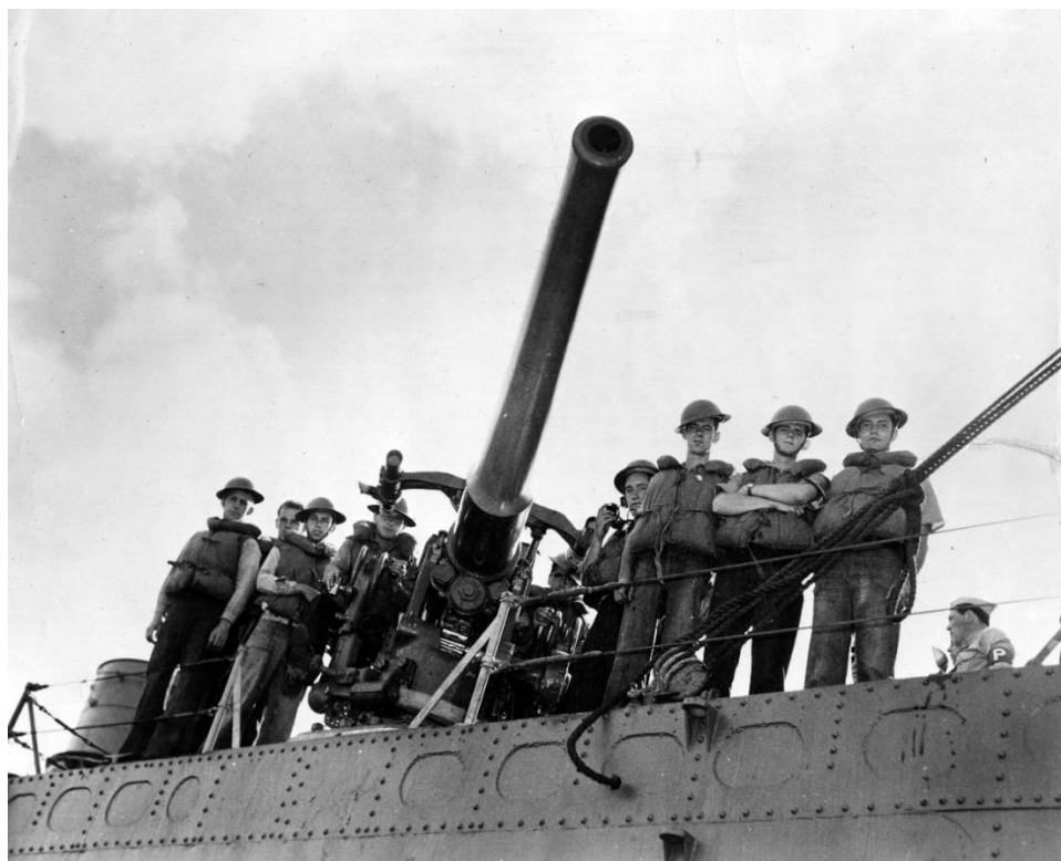
Figure 1 Soldiers standing around the USS Ward Gun while in service.