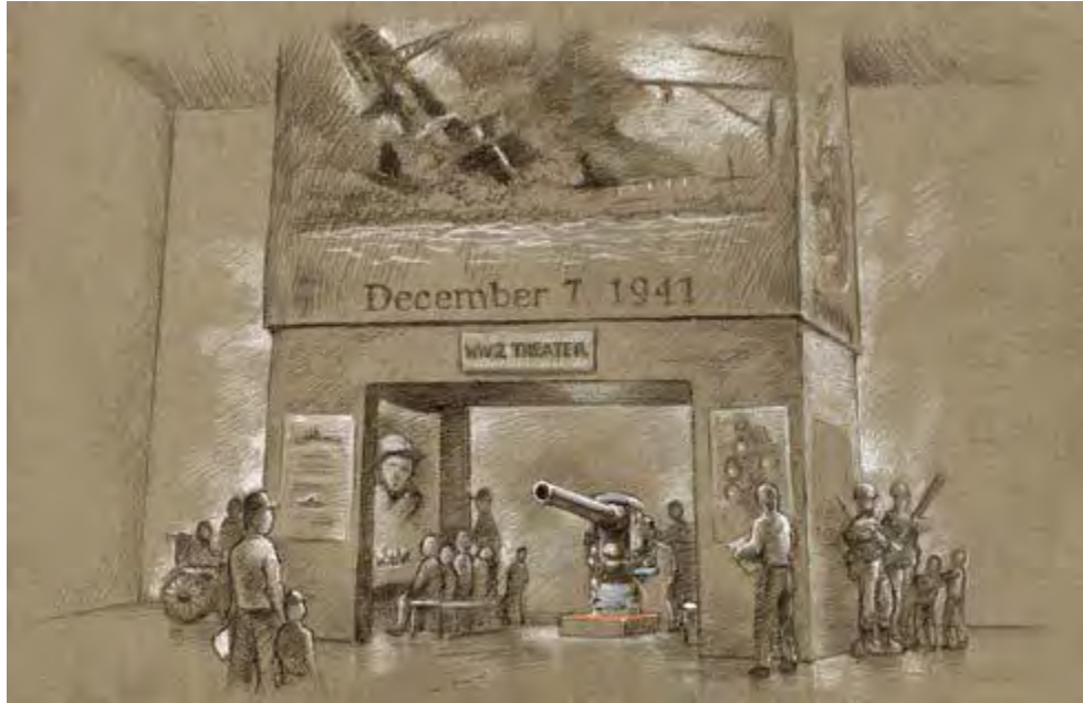
Figure 4 Interior renderings showing proposed placement and interpretation of the USS Ward Gun inside the MMVM

In May 2024, The Legacy Committee of the Minnesota State Legislature provided a $275,000 grant to the Minnesota Military and Veterans Museum at Camp Ripley for the restoration, relocation, and interpretation of the USS Ward Gun and World War II display. The funding is also applicable to site reclamation and improvements at the proposed removal site.