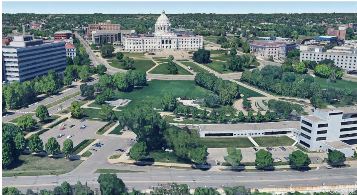
Figure 8 Aerial view of the USS Ward Gun current location, with the Veterans Services Building on right.

The move to its current location was also consistent with the thematic groupings identified in the 1990’s new mall design framework, which affirmed preference for commemoration of individuals along John Ireland, and to focus war memorials along the vacated Columbus, nearer to the Veterans Services Building. These groupings were again affirmed in the most recent update to the Capitol Mall Design Framework (2024).