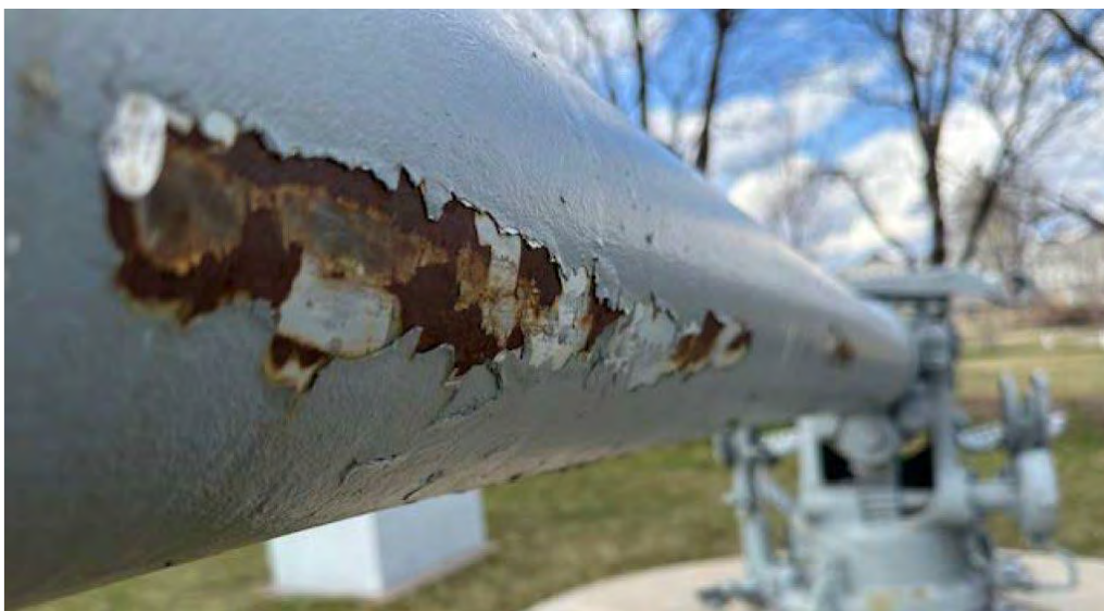
Figure 5 An Image showing the deterioration on the USS Ward Gun

In May 2024, The Legacy Committee of the Minnesota State Legislature provided a $275,000 grant to the Minnesota Military and Veterans Museum at Camp Ripley for the restoration, relocation, and interpretation of the USS Ward Gun and World War II display. The funding is also applicable to site reclamation and improvements at the proposed removal site.