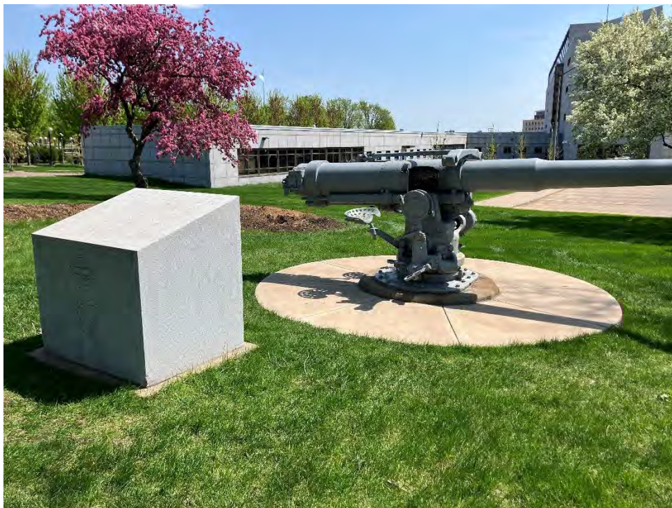
Figure 11 An image of the commemorative signage next to the USS Ward Gun

The top inscription reads “DEDICATED TO THE FOLLOWING MEN OF THE 47 TH DIVISION 11 TH BATTALION 9 TH NAVAL DISTRICT US NAVAL RESERVE. ST PAUL MINNESOTA ORDERED TO ACTIVE DUTY JANUARY 21, 1941. THESE MEN ALL SERVED ON BOARD THE DESTROYER USS WARD DD 139 WHICH FIRED THE FIRST SHOT OF THE WORLD WAR II AT PEARL HARBOR BY SINKING A JAPANESE MIDGET SUBMARINE ON DECEMBER 7, 1941 AT 6:45AM.”