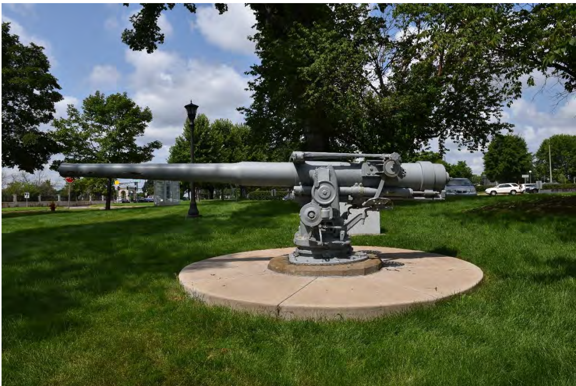
Figure 2 An image of the USS Ward Gun facing west in its current location.

The First Shots Naval Vets were a prominent feature of the city of Saint Paul. The last surviving member of the USS Ward's crew from Pearl Harbor, Alan Sanford, passed away in January of 2015.