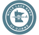
Misi-zaaga'iganiing Mille Lacs Band of Ojibwe