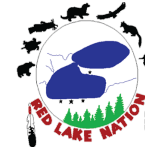
Miskwaagamiiwi-Zaagaiganing Red Lake Nation