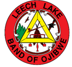
Gaa-zagaskwaajimekaag Leech Lake Band of Ojibwe