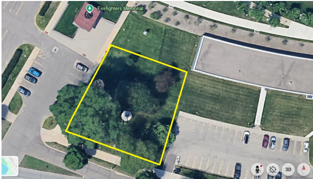
Figure 1. Recommended Site.

recommending a site for the proposed work for public comment and Board consideration. Staff and Advisors are permitted to only bring one site to the Board for review per M. R. 2400.2703, Subpart 3, Item F. The recommended site is pictured below.