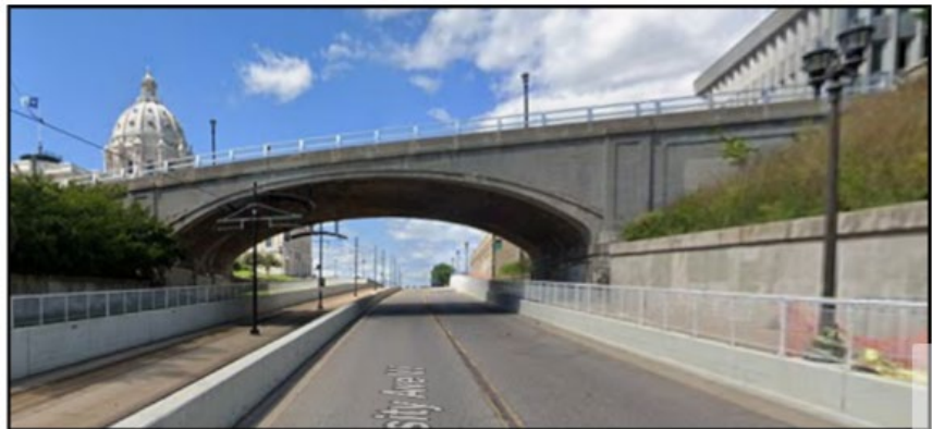
BRIDGE 9250 - 2024