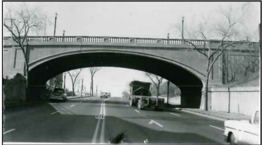
BRIDGE 9250 - 1961

Ramsey County is investigating this bridge to determine a path forward, of which current options include full rehabilitation and full removal with a new, context-sensitive bridge so a plan is in place, somewhere in the 2030/2031 timeframe, before the bridge enters this "Poor" condition state. Both options will have a substantial effect on Light Rail Transit (Green Line) service, which, realistically, could see a loss of service during an entire construction season.