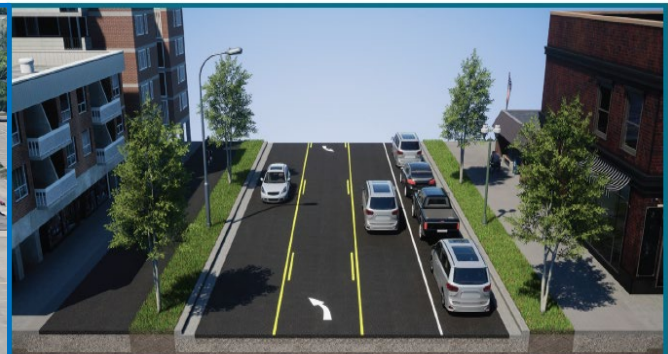
North of University: Shared Use Path