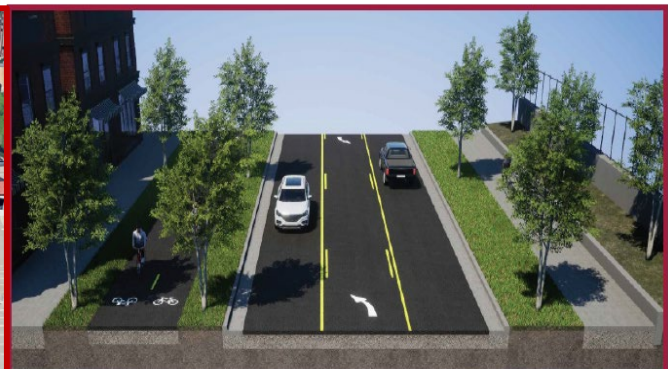
South of University: Two-Way Cycle Track