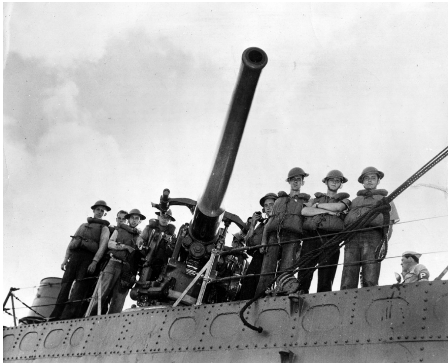
Figure 1 The USS Ward Number Three Gun and its crew.