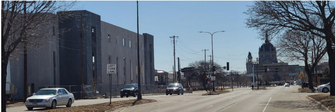
Photo looking south at three story academic wing facing Marion near between university and Sherburne (foreground).