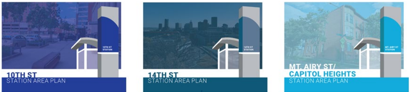
Image from Bronze Line BRT TOD station area planning website.

The transit-oriented development (TOD) station area plans for the Bronze Line (formerly known as the Purple Line) bus rapid transit (BRT) were developed through a collaborative effort of a project team that included planning, design, and engagement professionals; representatives of Ramsey County, the City of Saint Paul, the Capitol Area Architectural and Planning Board (CAAPB); and many community-based organizations, residents, and transit users. The eight Draft Bronze Line BRT TOD Station Area Plans are located on the project website: https://www.metrotransit.org/bronze-line-project-station-area-planning . Three of the eight station area plans include land within the CAAPB jurisdiction: 10 th St, 14 th St, and Mt. Airy Street/Capitol Heights.