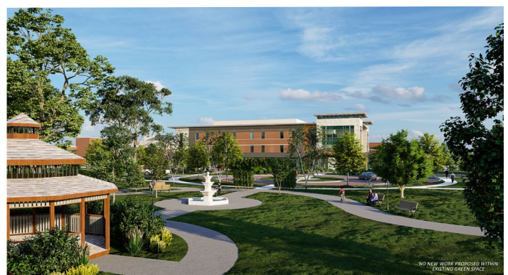
View from East from Existing Green Space