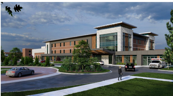
View from Northeast