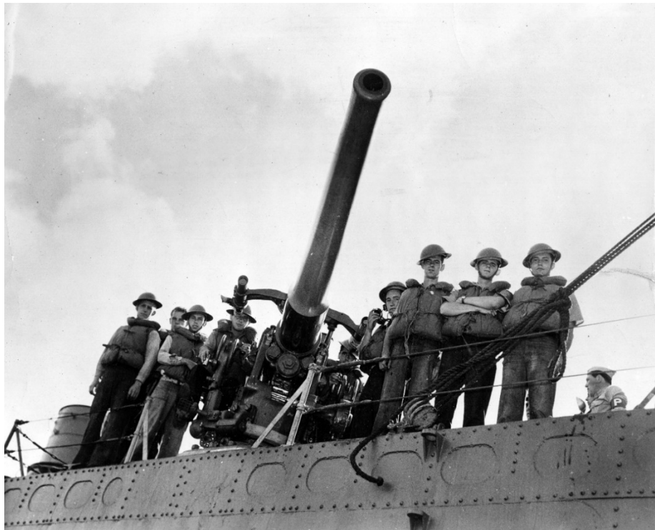
The USS Ward Number Three Gun and its crew.