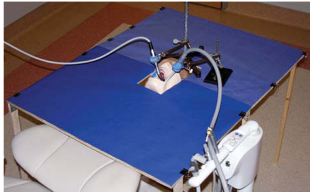
Figure 1. Overview of the experimental design setup.

To achieve a power of 0.80 (effect size = 0.20; P < .05 ), 24 trials in each group were necessary. Therefore, we conducted eight trials for each of the three teeth tested in each group (that is, the control and two experimental groups). This resulted in a total of 72 trials for the experiment. Two graders (M.C.H., J.M.L.) each scored 36 trials. To analyze the data, we conducted a two-way analysis of variance (ANOVA) with the use of statistical software (PASW statistics 18.0.0, IBM, Armonk, N.Y.). The results of the ANOVA indicated both significant main effects