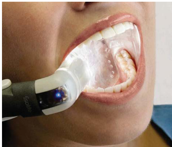
Figure 2. Placement of the Isolite system (Isolite Systems, Santa Barbara, Calif.) in the mouth, showing close adaptation to the oral soft tissues. Image of the Isolite system reproduced with permission of Isolite Systems, Santa Barbara, Calif.