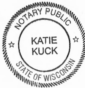
(Signature of notary officer)