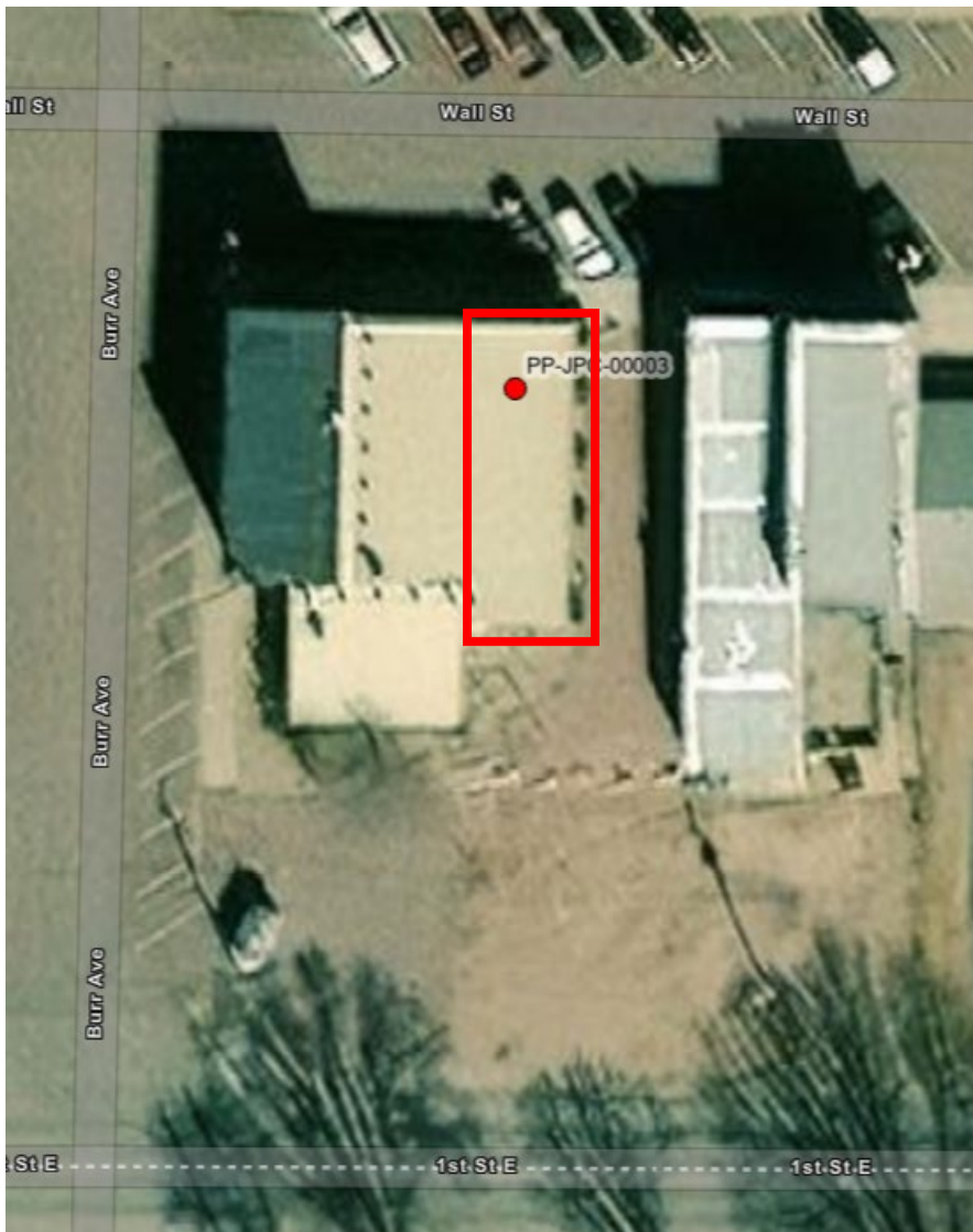
Figure 1: Stordahl Building. MnSHIP, accessed March 16, 2026.

The national register nomination form describes the legal description as: Lot 10, Block 2, Original Plat