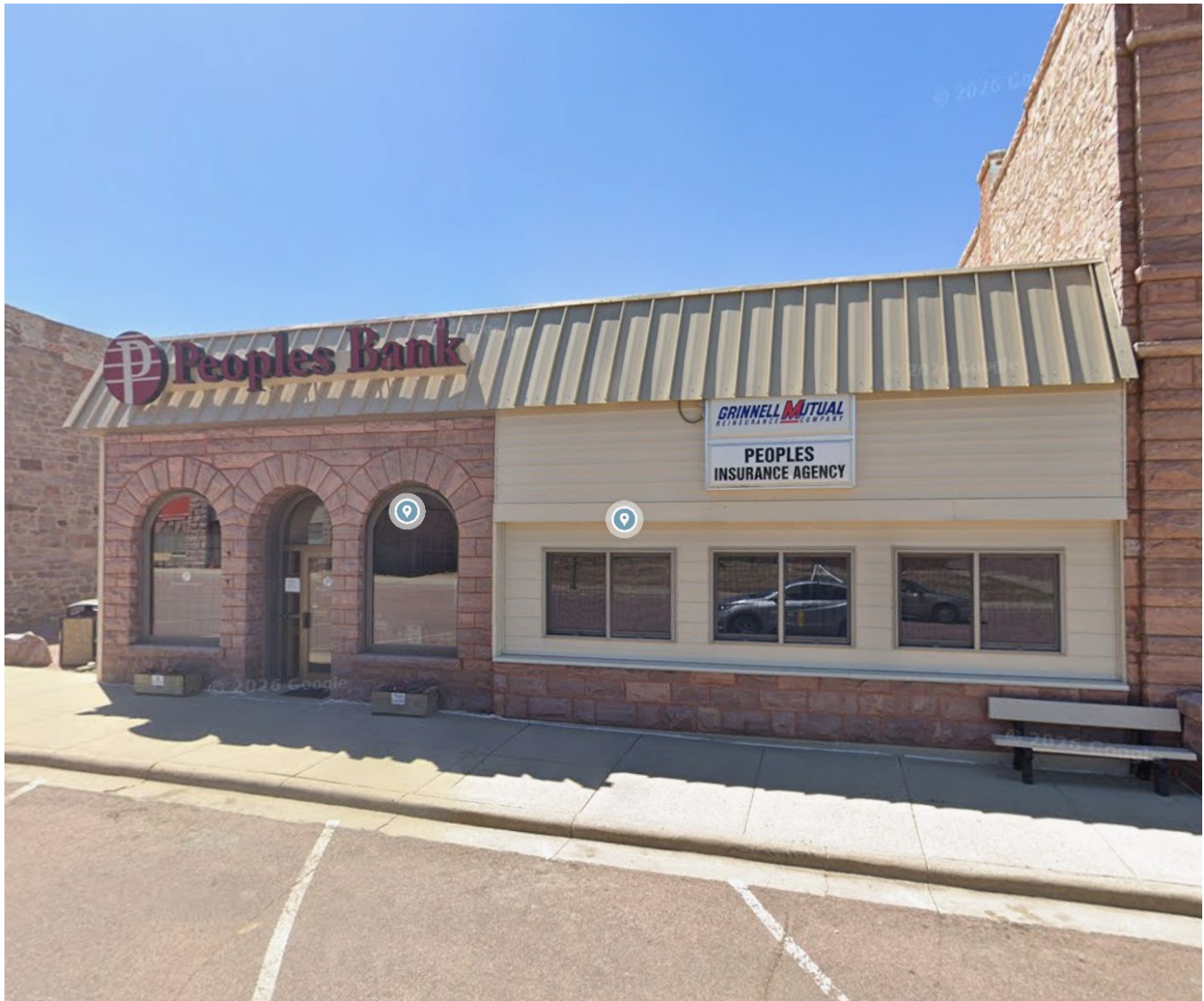
Figure 4: Stordahl Building, Google Streetview June 2024