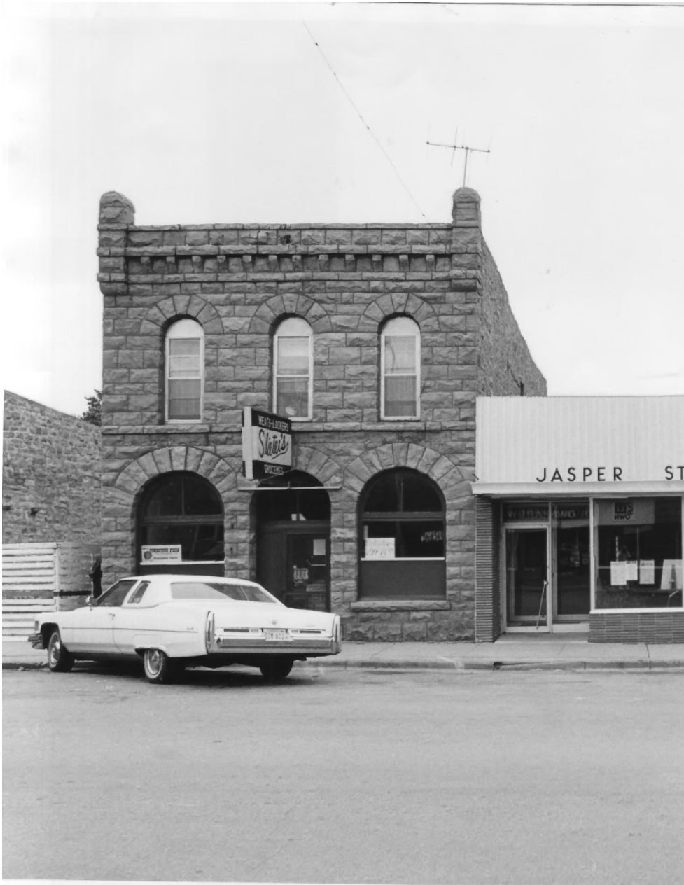
Figure 2: NRHP photograph of Stordahl Building, June 1978