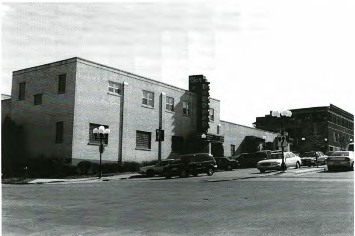
New Ulm Commercial Historic District Brown Co., Mn #16

Name of Property New Ulm Commercial Historic District County and State Brown County, MN NR Reference Number 05001438