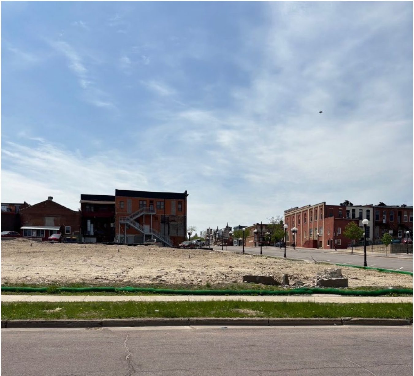
Figure 2: Former location of George's Ballroom. Photo courtesy of Ellwood Zabel, May 2025.

Name of Property New Ulm Commercial Historic District County and State Brown County, MN NR Reference Number 05001438