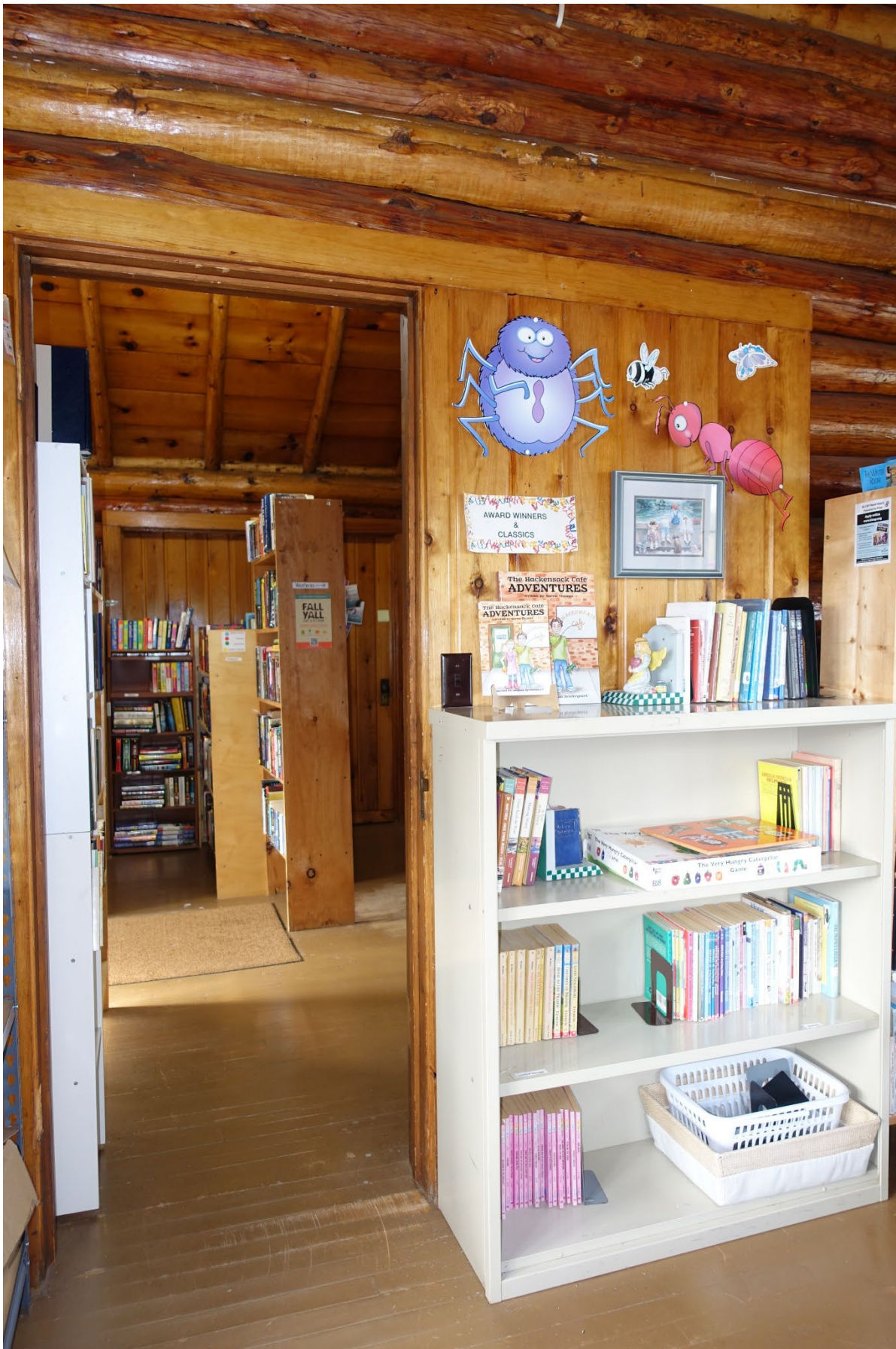
MN_Cass County_Hackensack Conservation Building_0014

North room, looking from the north room into the center room with former doorway at right infilled, facing south (September 14, 2022)