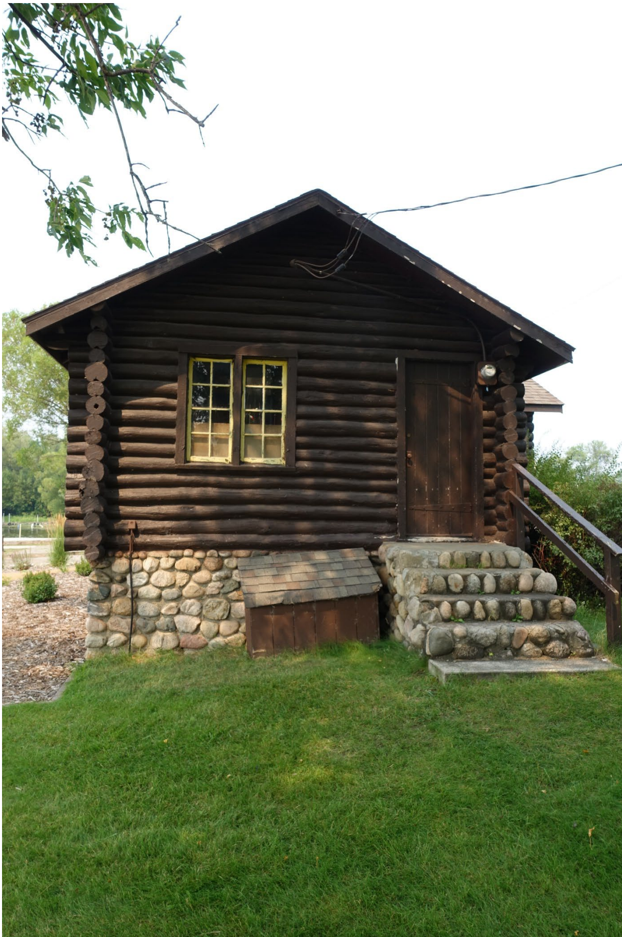
MN_Cass County_Hackensack Conservation Building_0005 South elevation, facing north