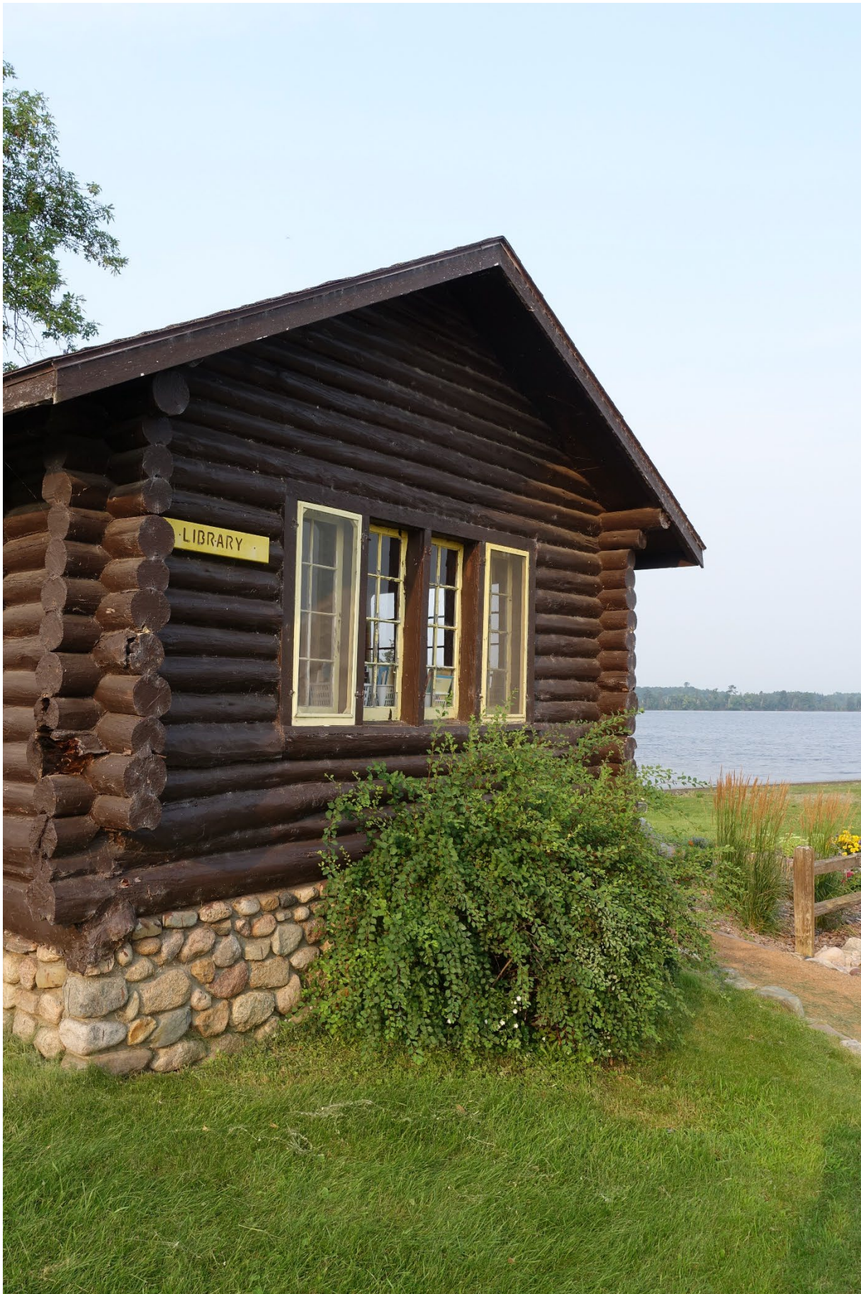
MN_Cass County_Hackensack Conservation Building_0004 North elevation, facing southwest