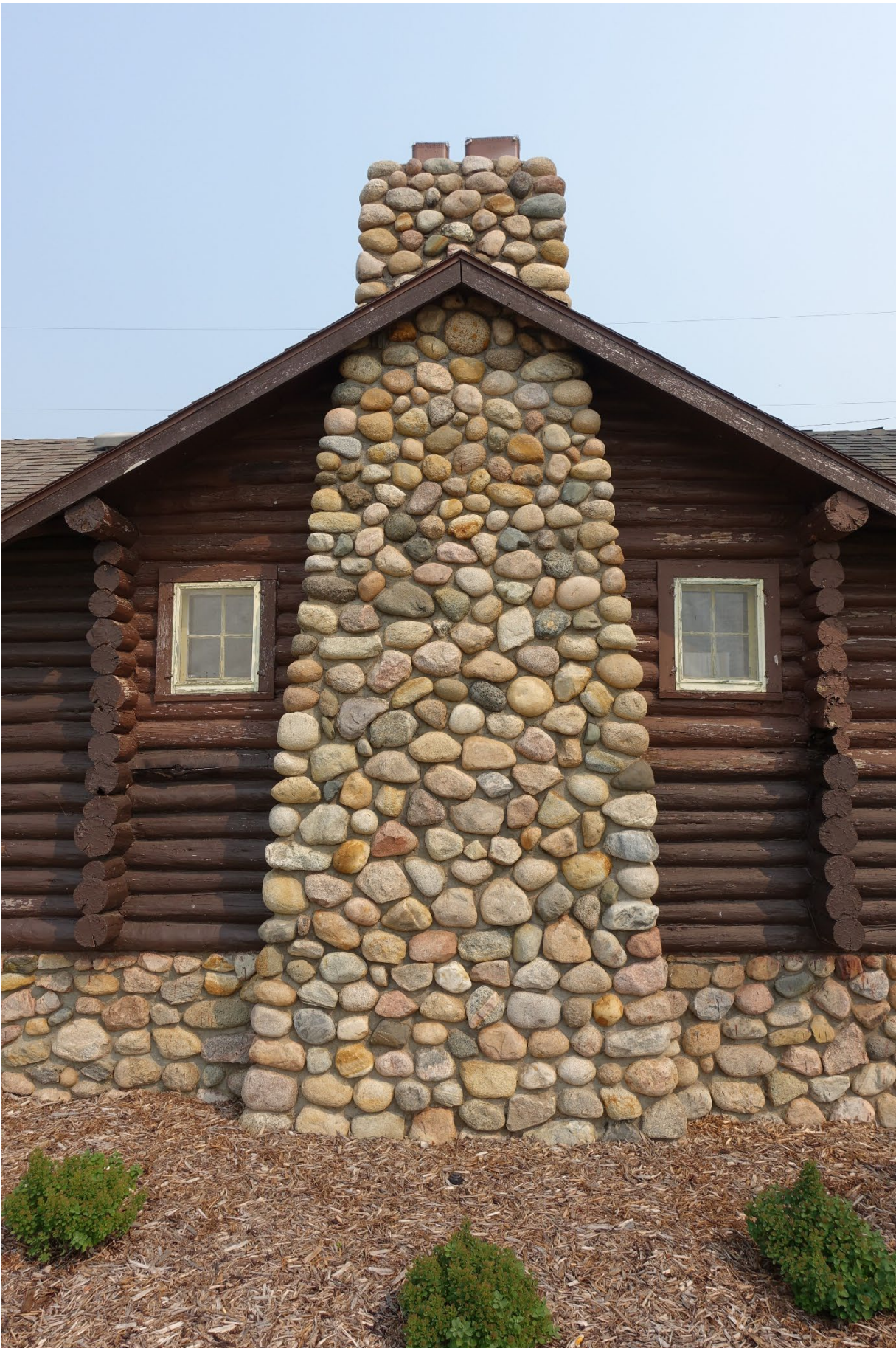
MN_Cass County_Hackensack Conservation Building_0008 Stone chimney, west elevation, facing east