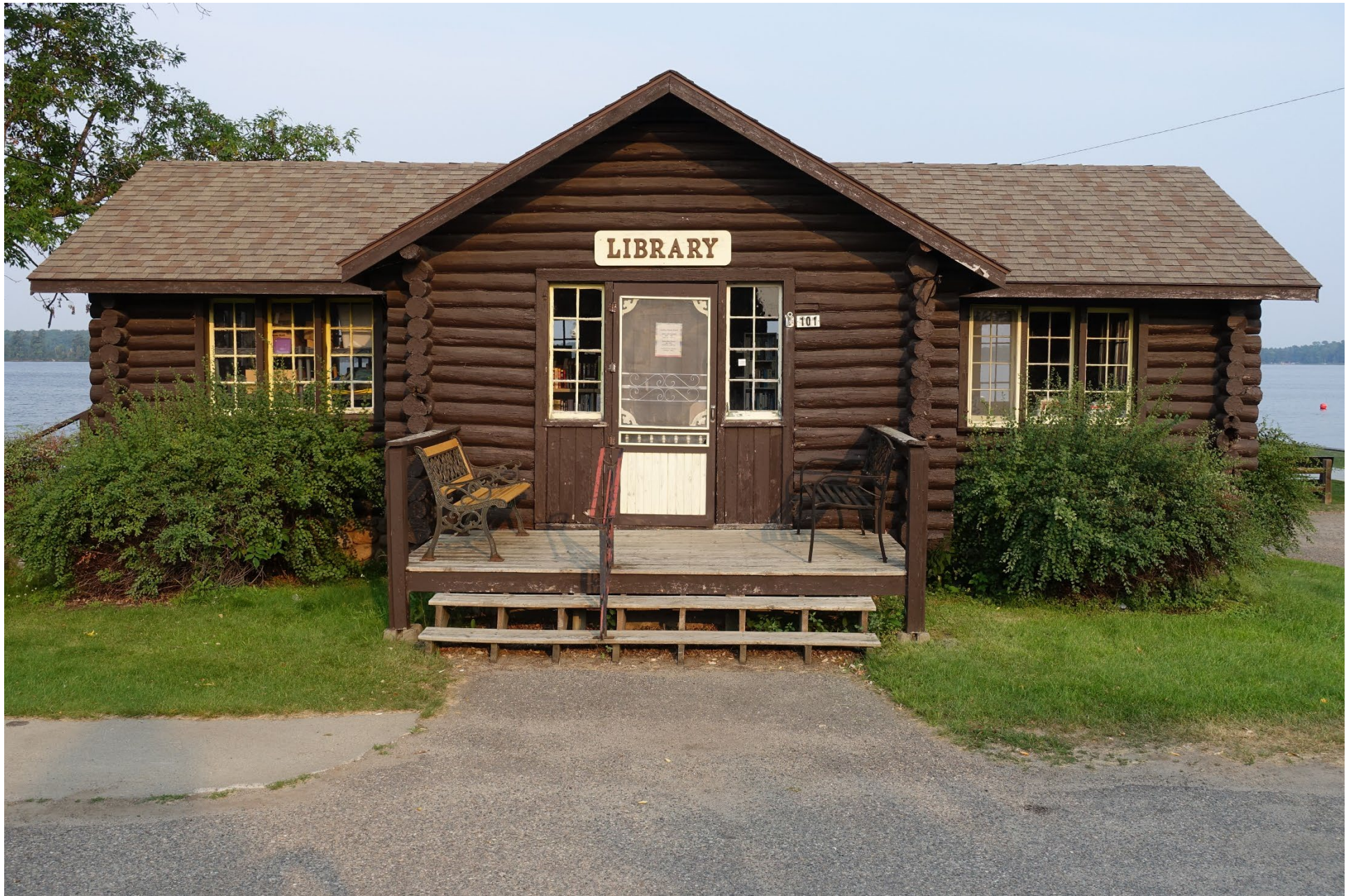
MN_Cass County_Hackensack Conservation Building_0002 East elevation, facing west