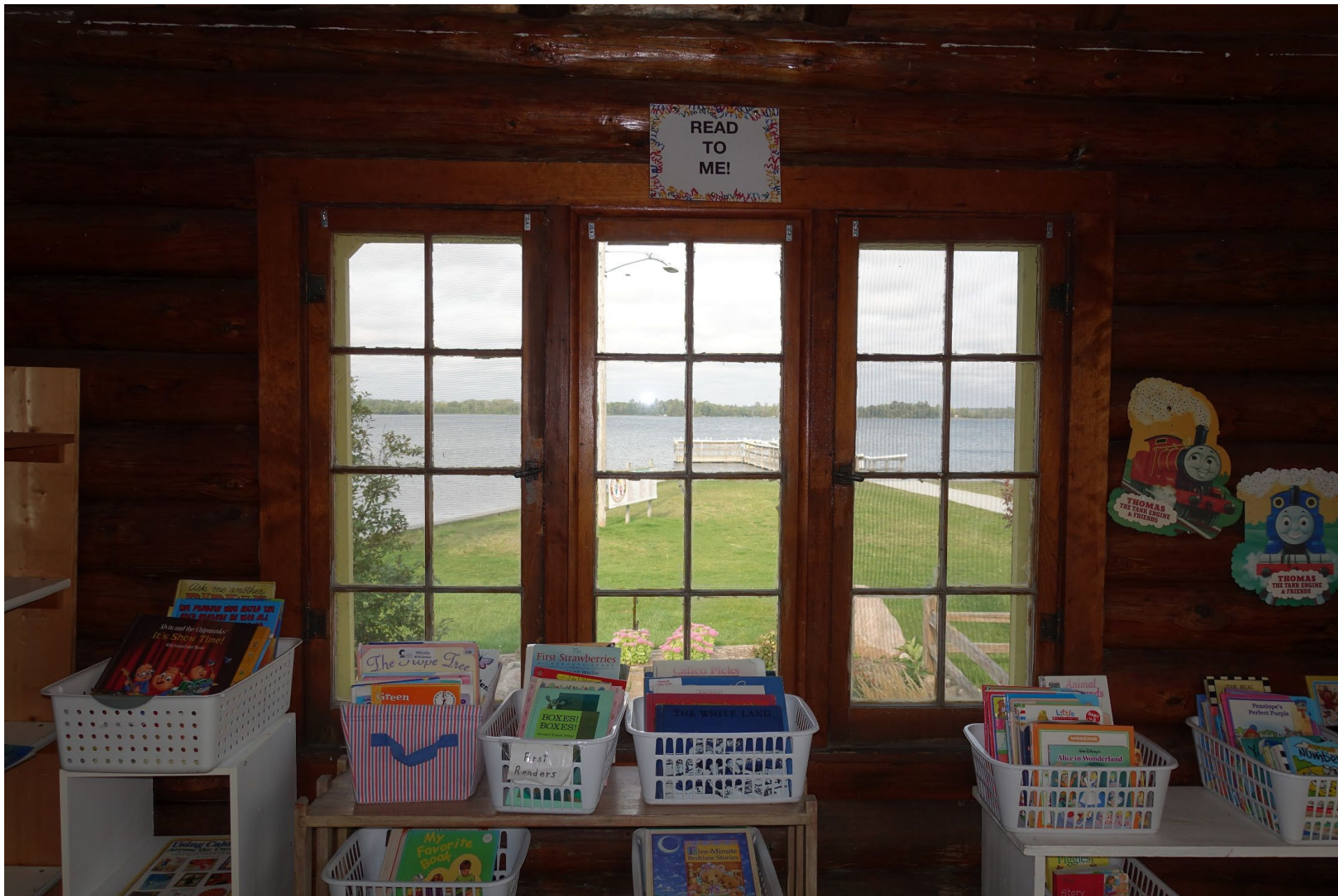
MN_Cass County_Hackensack Conservation Building_0016

North room, view through casement windows toward Birch Lake, facing west (September 14, 2022)