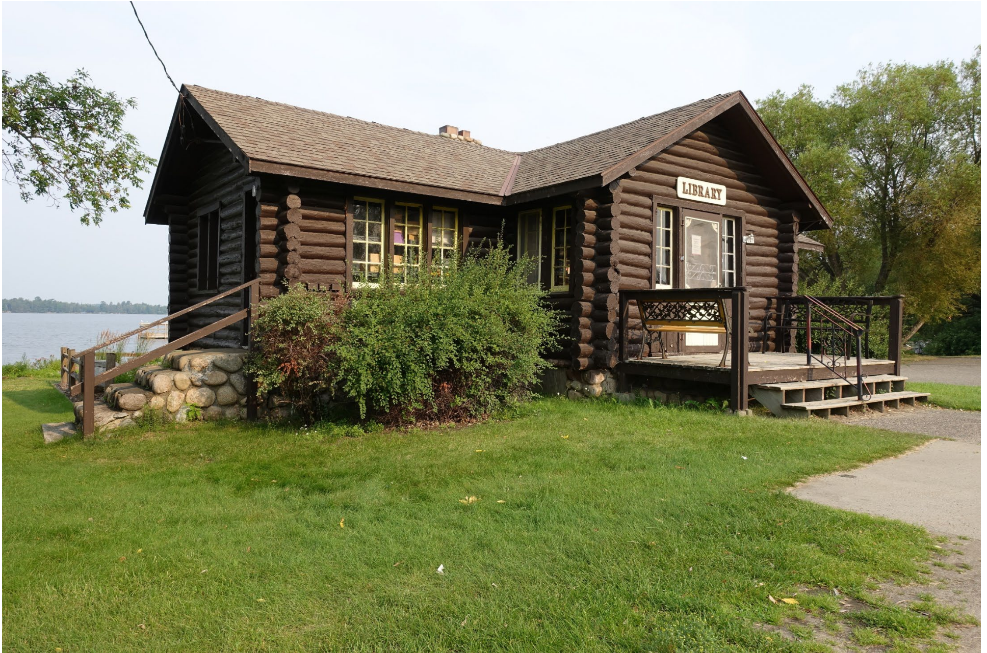
MN_Cass County_Hackensack Conservation Building_0003 East and south elevations, facing northwest