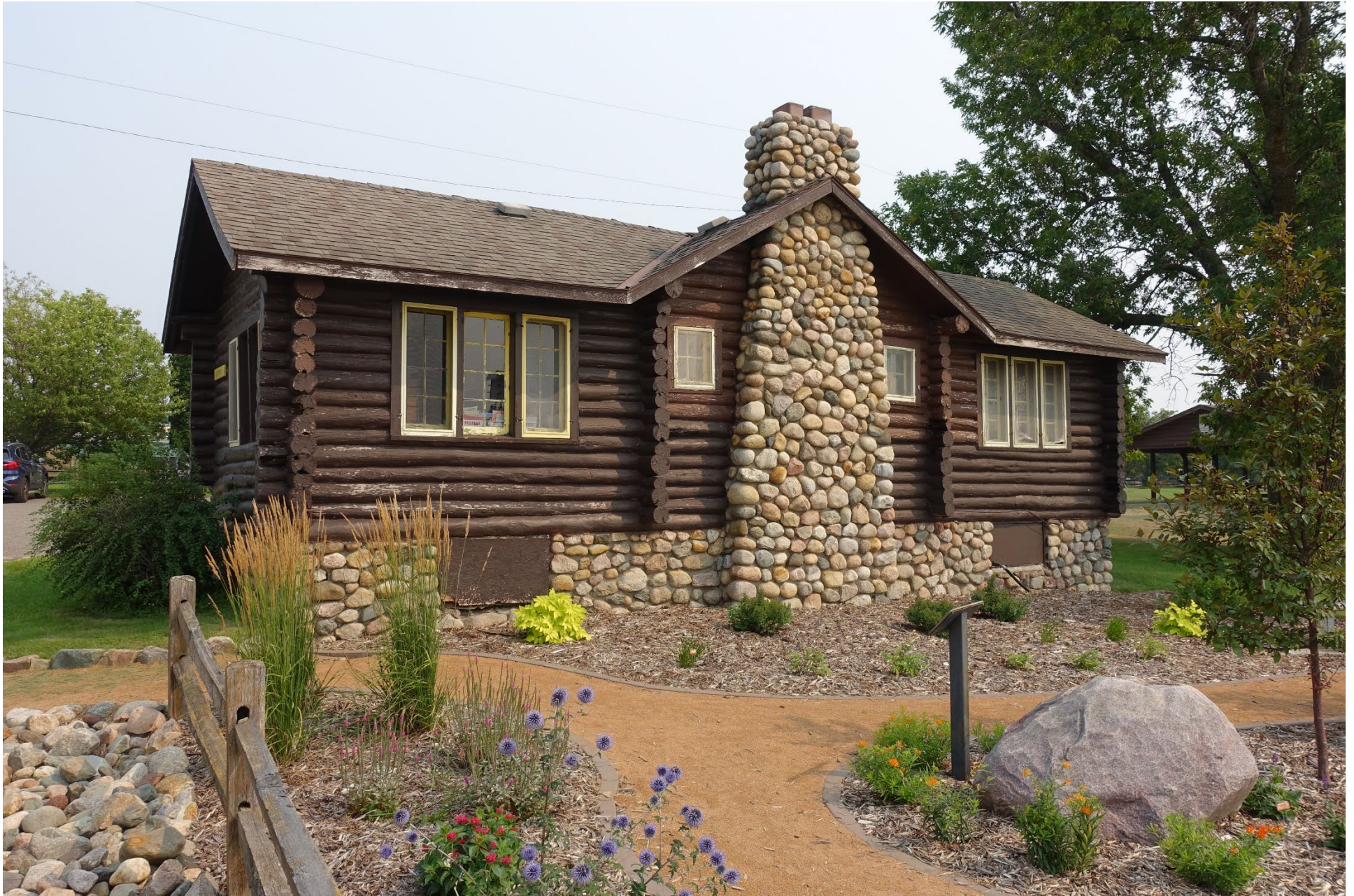
MN_Cass County_Hackensack Conservation Building_0007 West elevation, facing east