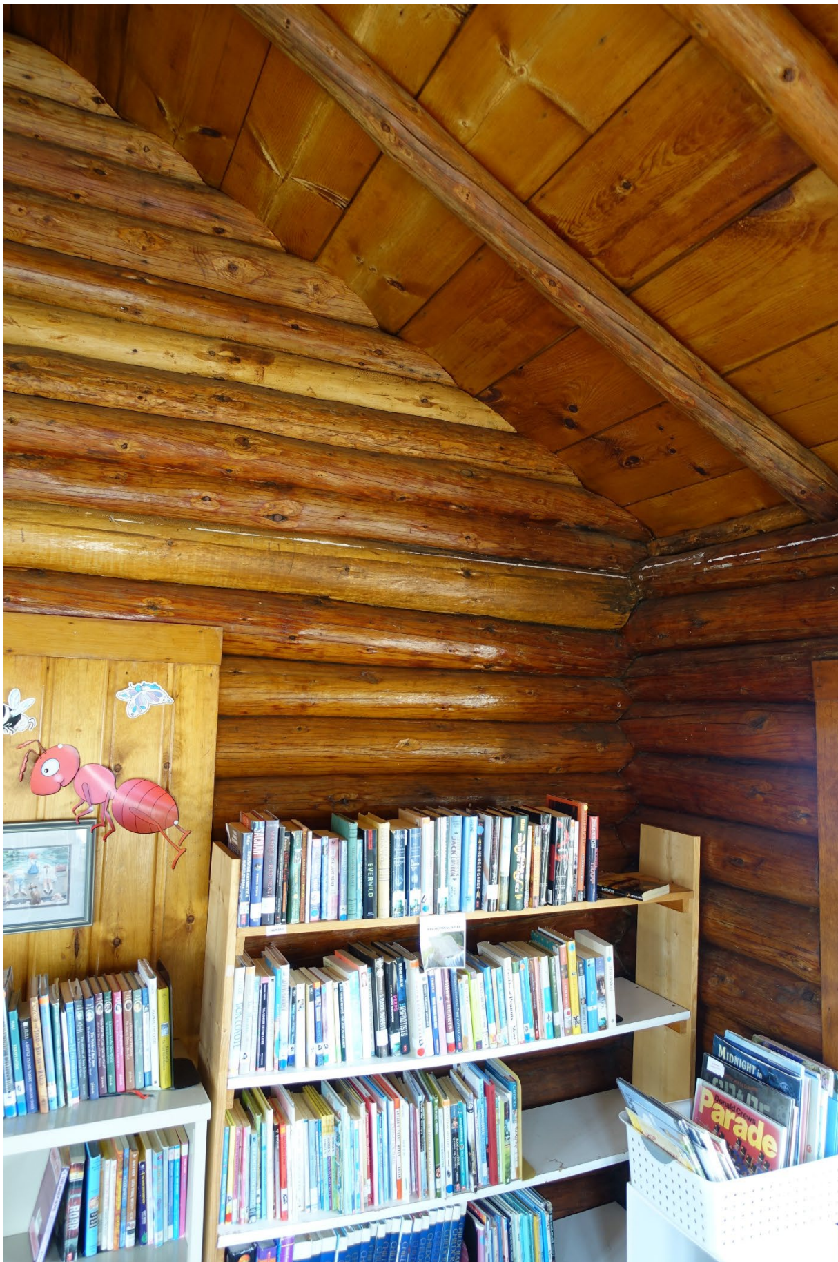
MN_Cass County_Hackensack Conservation Building_0015 North room, view of south and east walls and ceiling, facing southwest