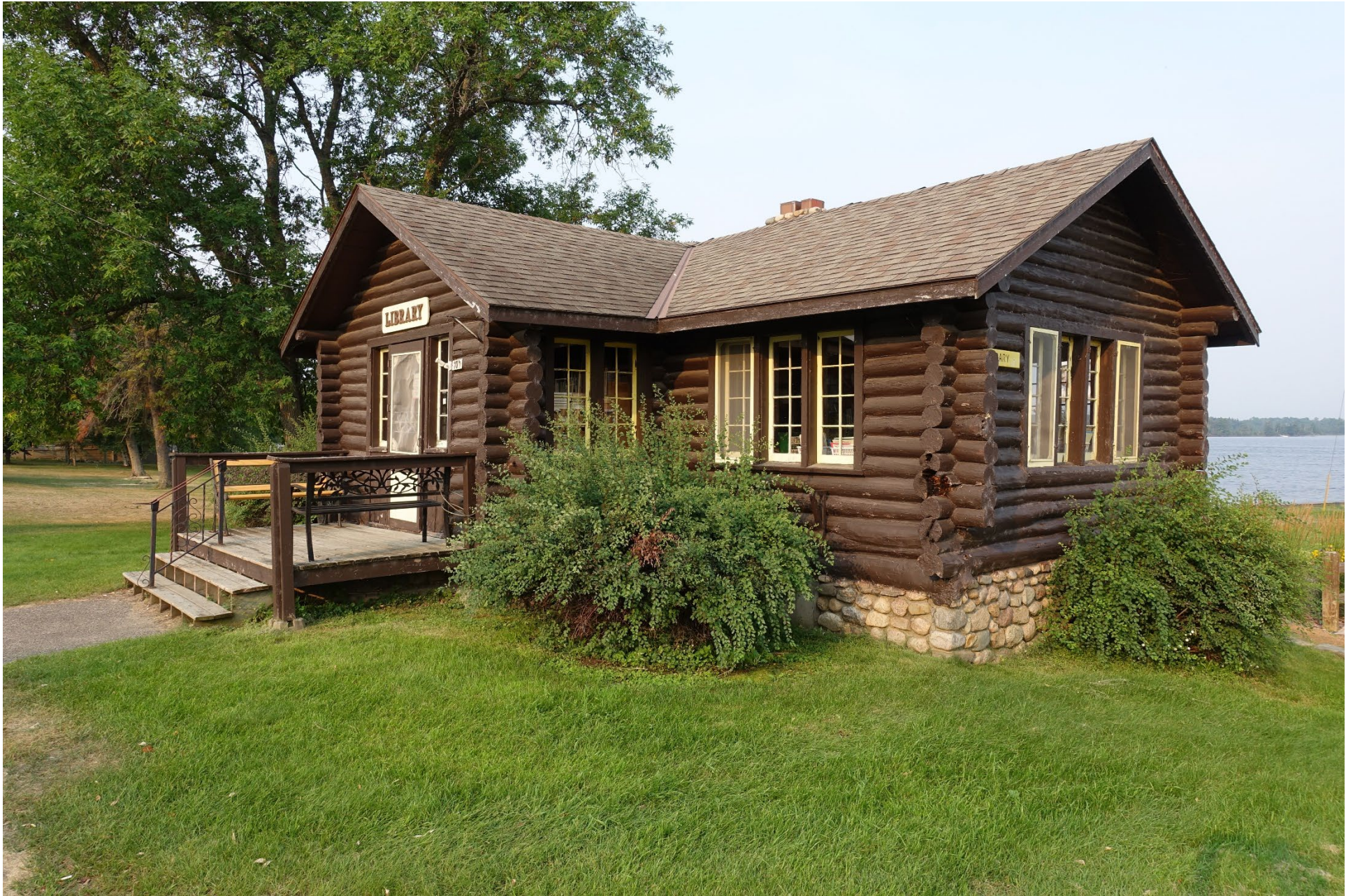
MN_Cass County_Hackensack Conservation Building_0001 North and east elevations, facing southwest