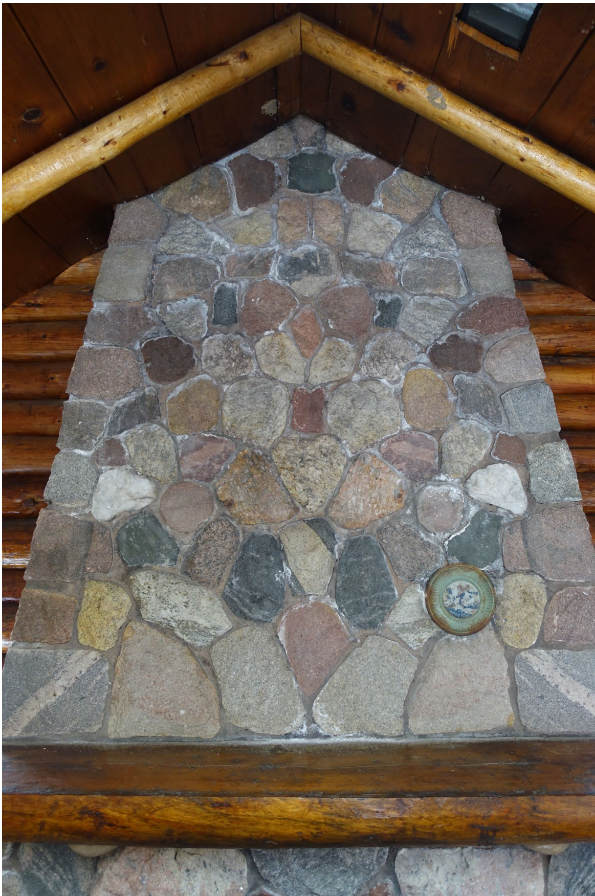
MN_Cass County_Hackensack Conservation Building_0011 Center room, upper portion of fireplace, facing west