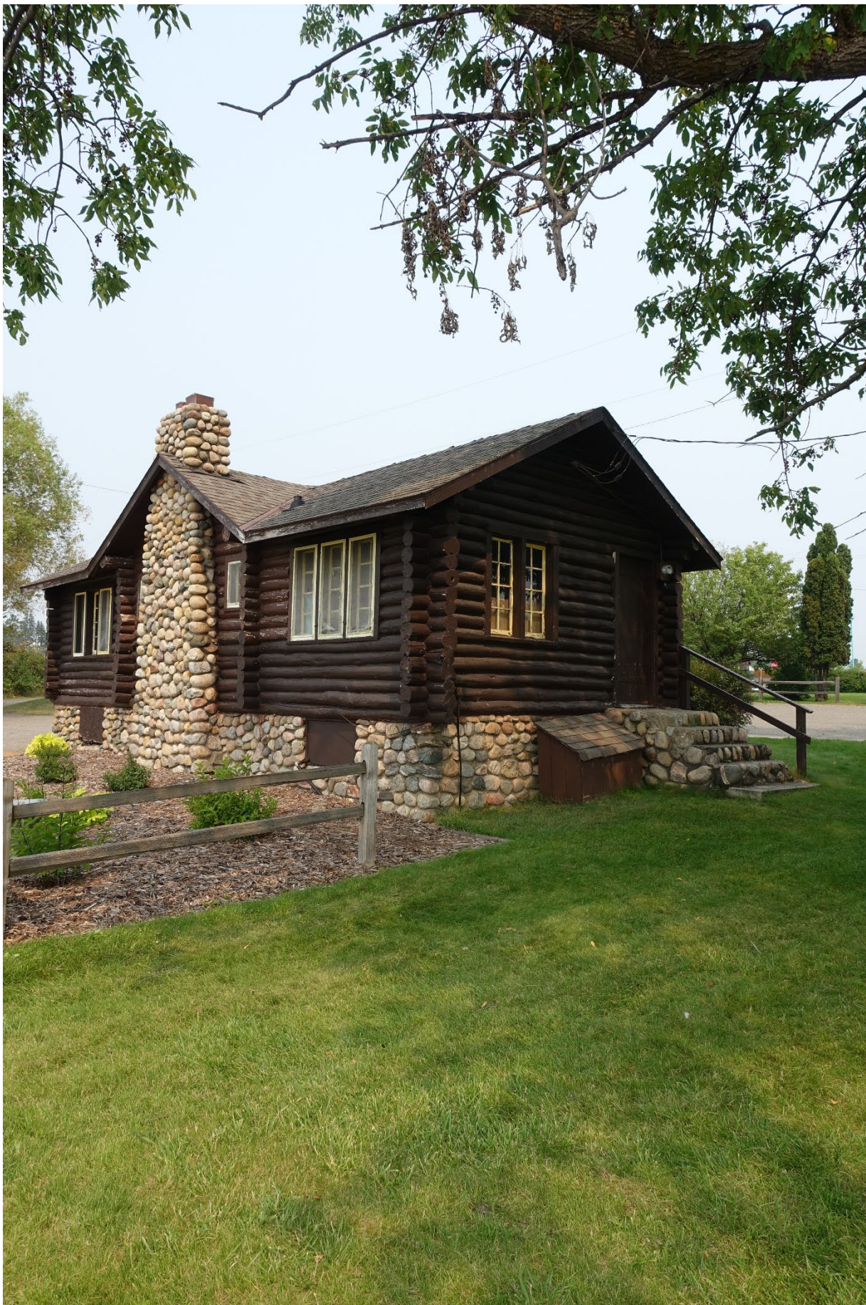
MN_Cass County_Hackensack Conservation Building_0006 South and west elevations, facing northeast