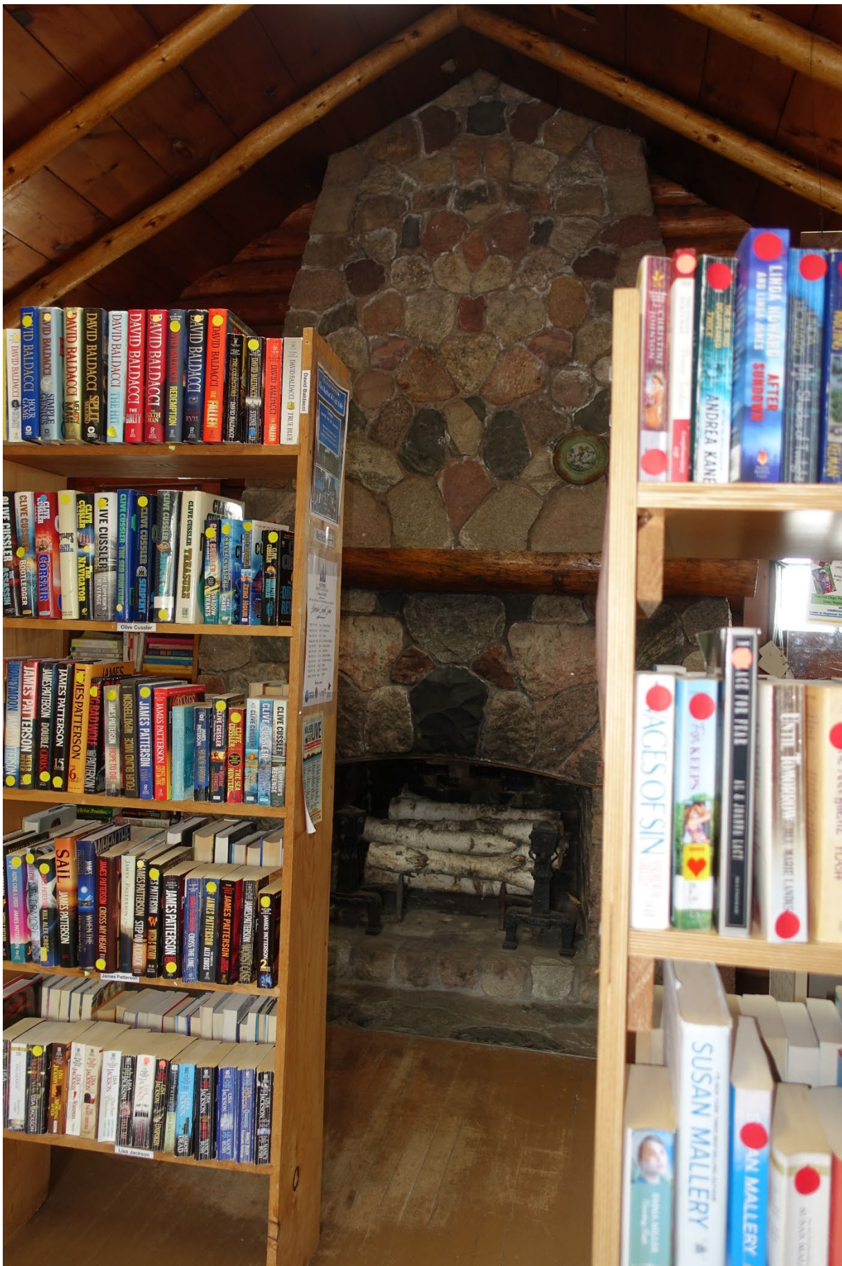
MN_Cass County_Hackensack Conservation Building_0009 Center room with stone fireplace, facing west