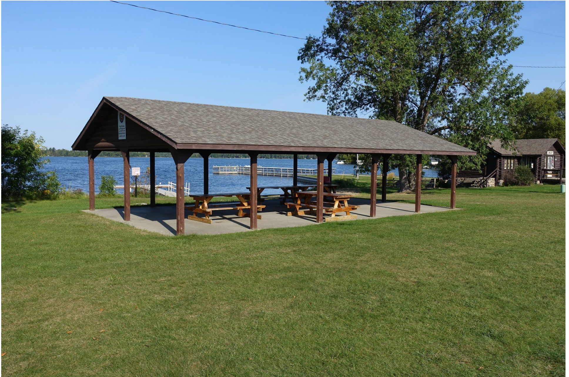
MN_Cass County_Hackensack Conservation Building_0017 Picnic Shelter with Conservation Building at right, facing northwest (September 13, 2022)