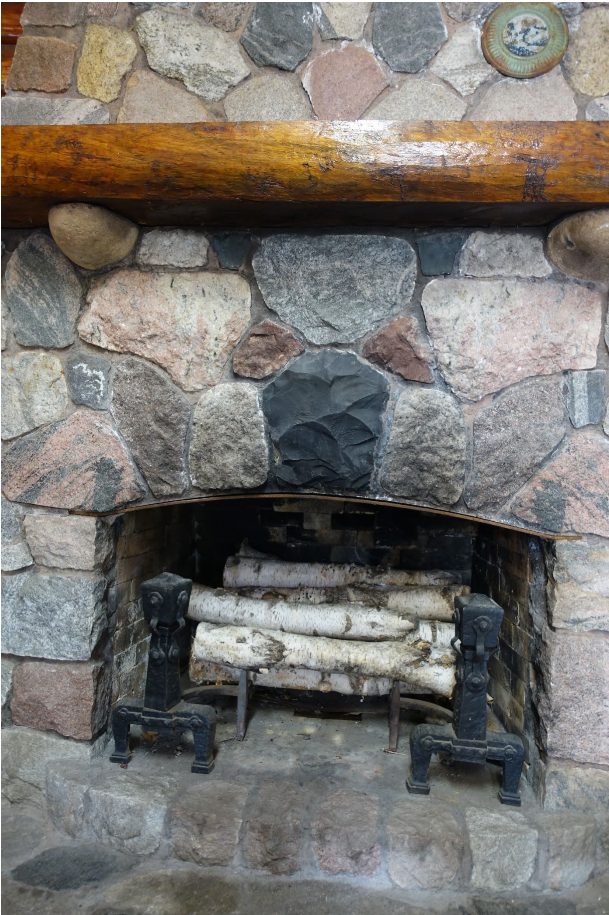
MN_Cass County_Hackensack Conservation Building_0010 Center room, fireplace hearth and mantel, facing west