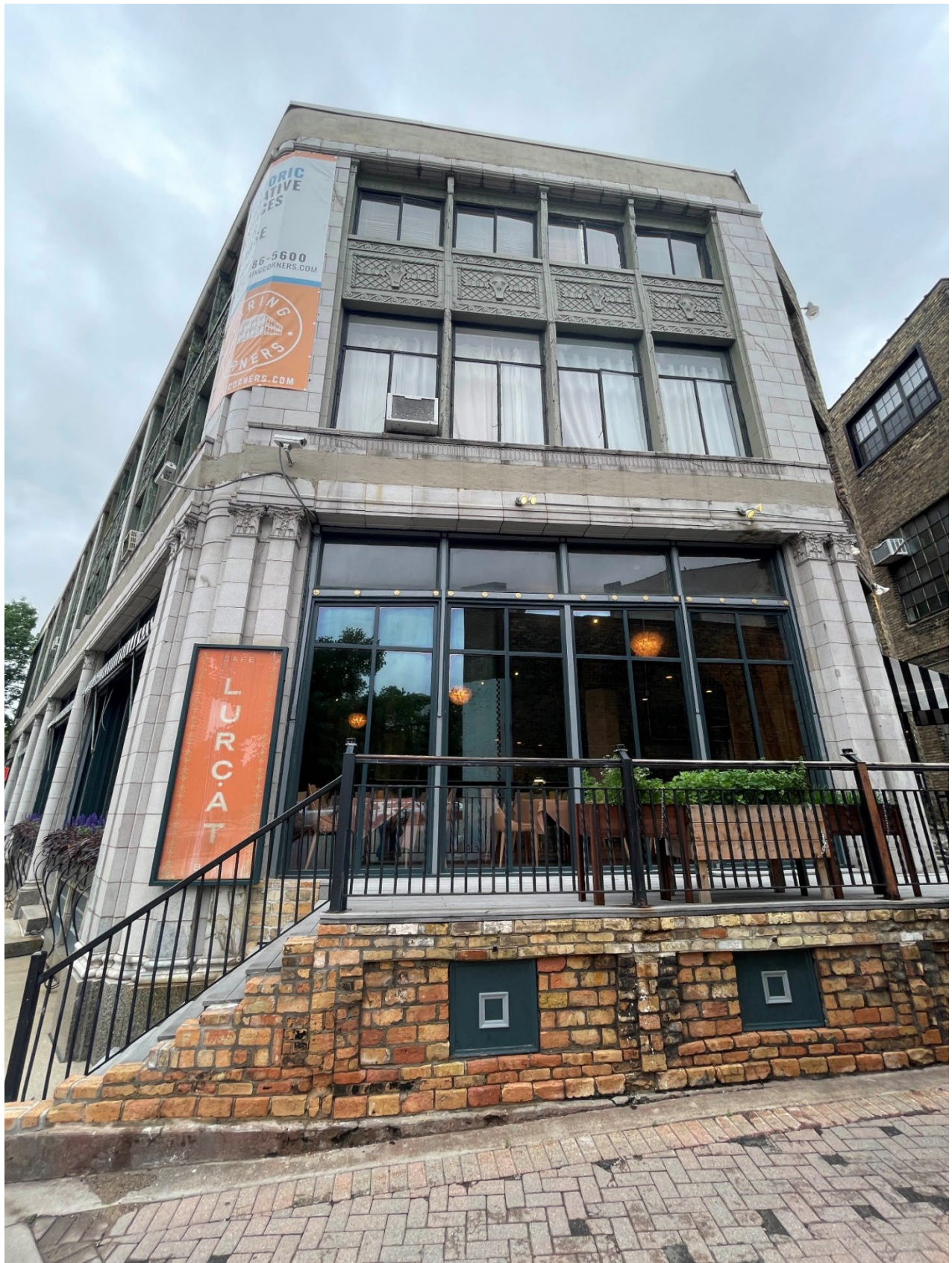
MN_Hennepin County_Fawkes Auto Complex_0010 East elevation of 1635 Hennepin Ave, looking west.