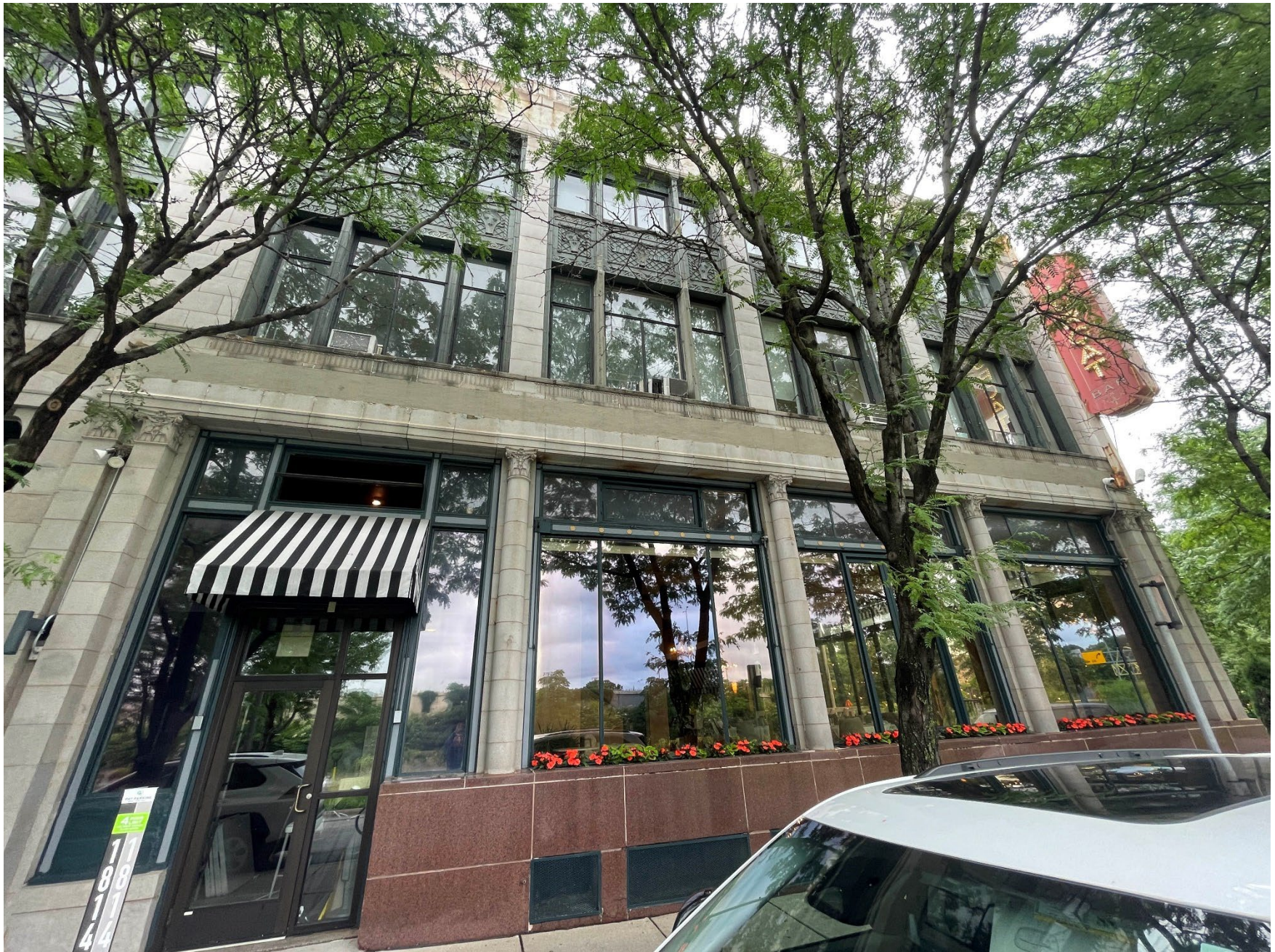
MN_Hennepin County_Fawkes Auto Complex_0007 West facade of 1635 Hennepin Ave, looking east.