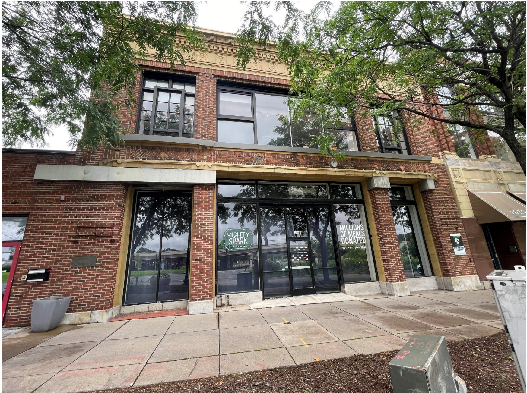
MN_Hennepin County_Fawkes Auto Complex_0001 West elevation of 1625 Hennepin Ave, looking east