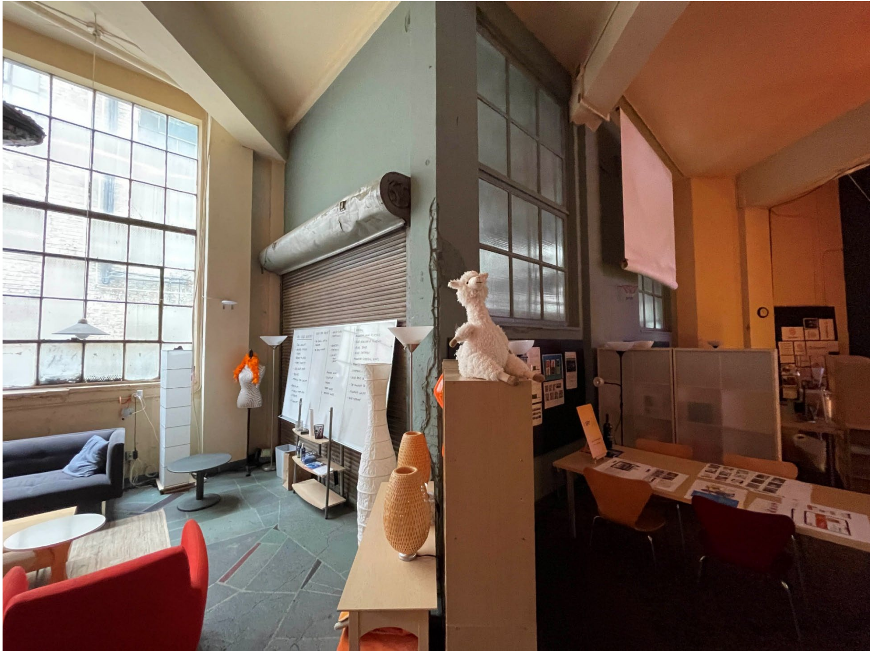
MN_Hennepin County_Fawkes Auto Complex_0018

First floor of 1639 Hennepin Ave, looking at automotive elevator (photo 56 for interior of elevator).