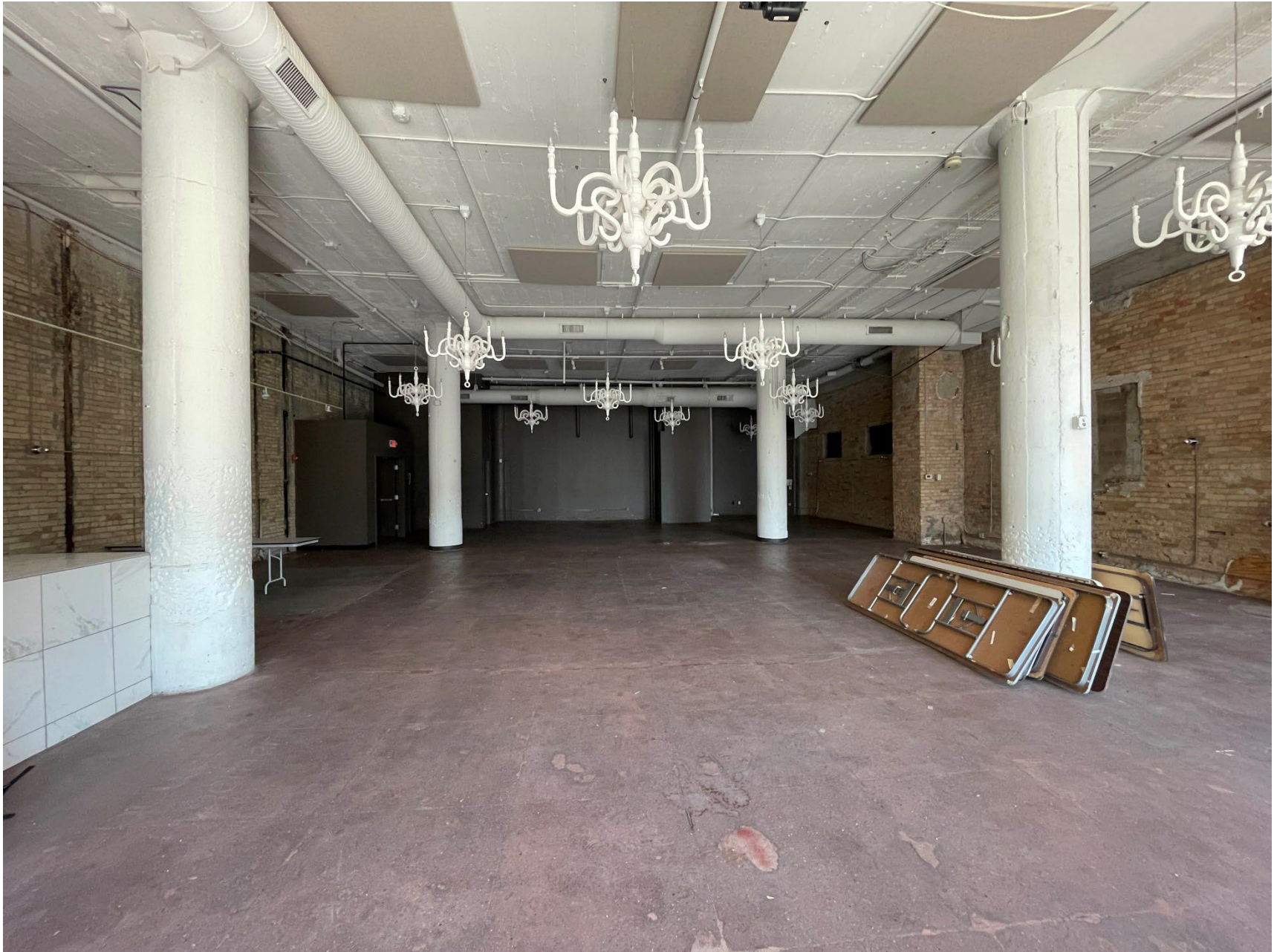
MN_Hennepin County_Fawkes Auto Complex_0014 First floor of 1625 Hennepin Ave, looking west.