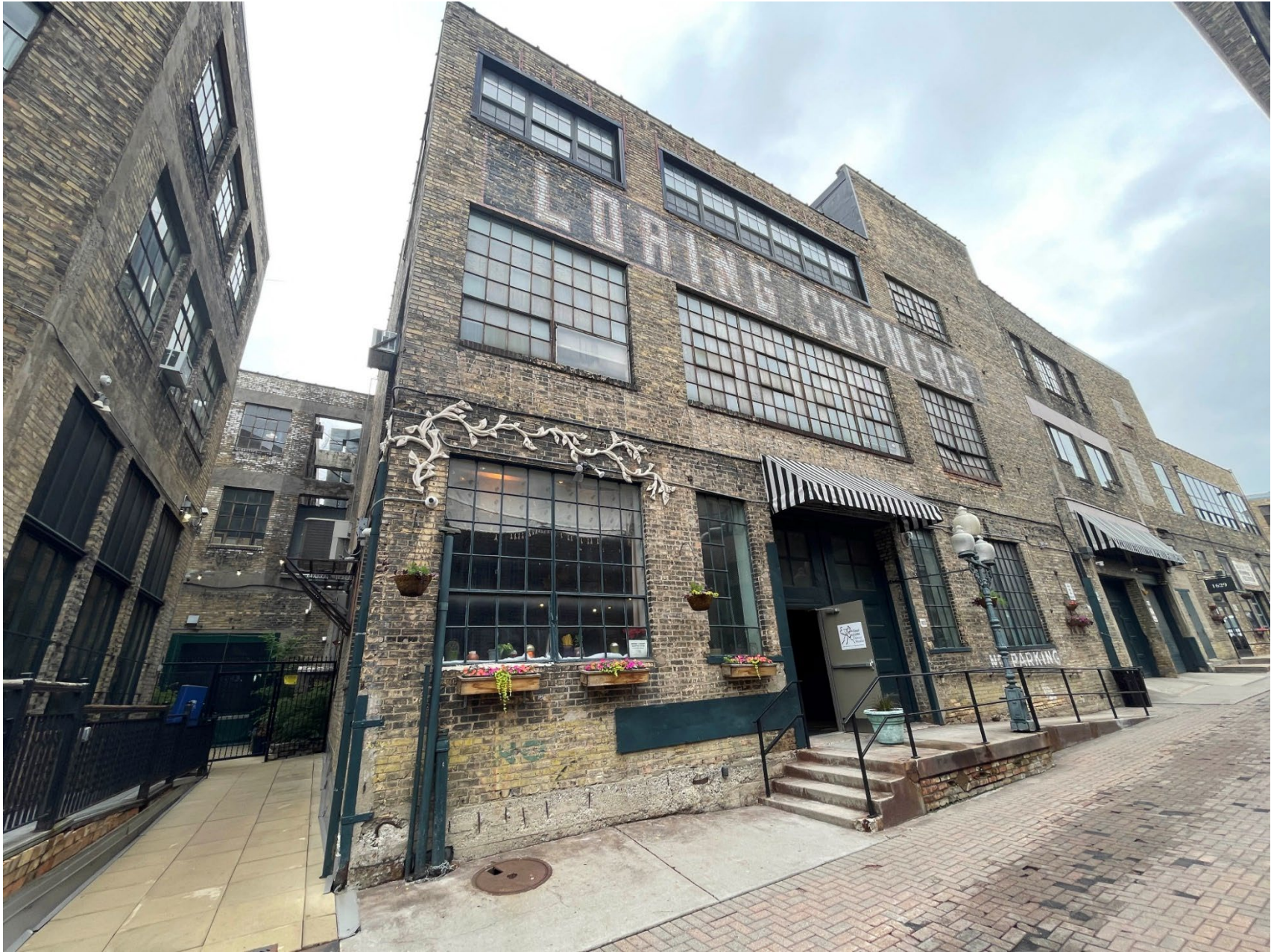
MN_Hennepin County_Fawkes Auto Complex_0027

East elevation of 1635 Hennepin Ave, photo taken from alley. Photo includes access to the dead-end alley (left) located behind 1635 Hennepin Ave.