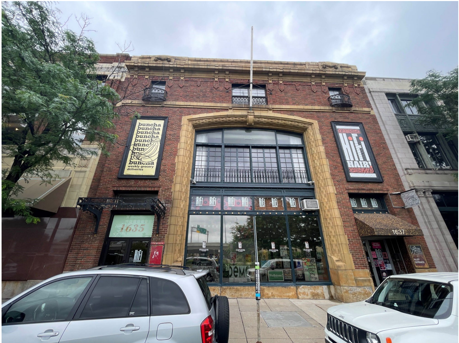
MN_Hennepin County_Fawkes Auto Complex_0003 West facade of 1635 Hennepin Ave, looking east.