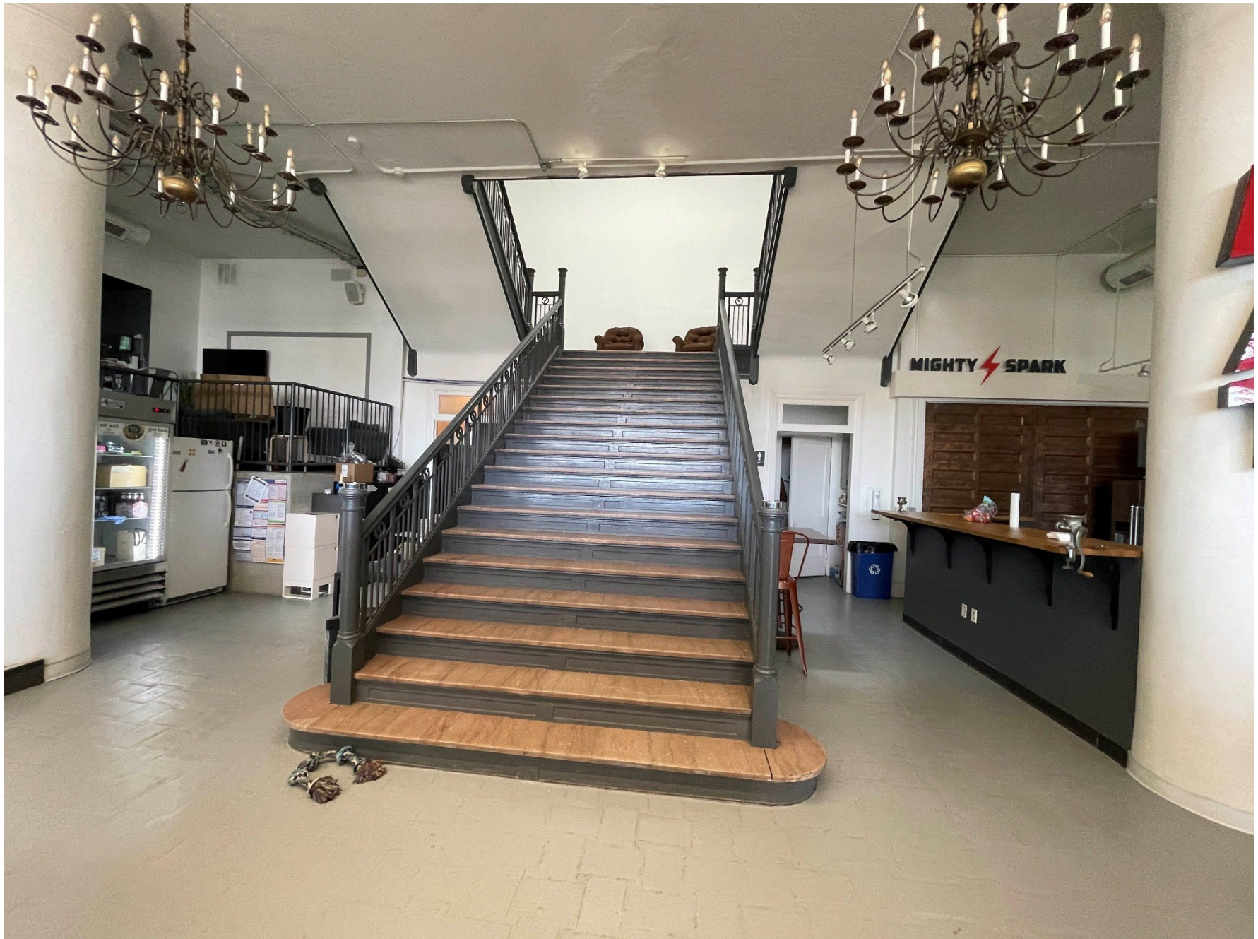
MN_Hennepin County_Fawkes Auto Complex_0012 First floor of 1625 Hennepin Ave, looking at the grand staircase.