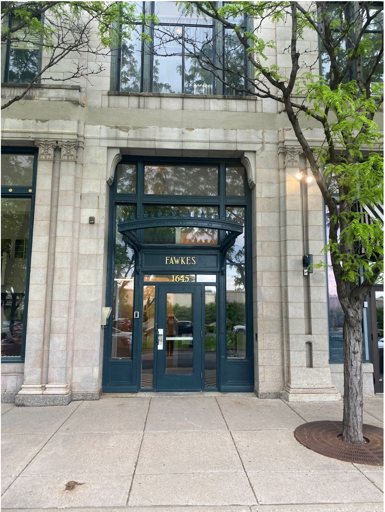
MN_Hennepin County_Fawkes Auto Complex_0006 West facade of 1635 Hennepin Ave, looking at front entrance.