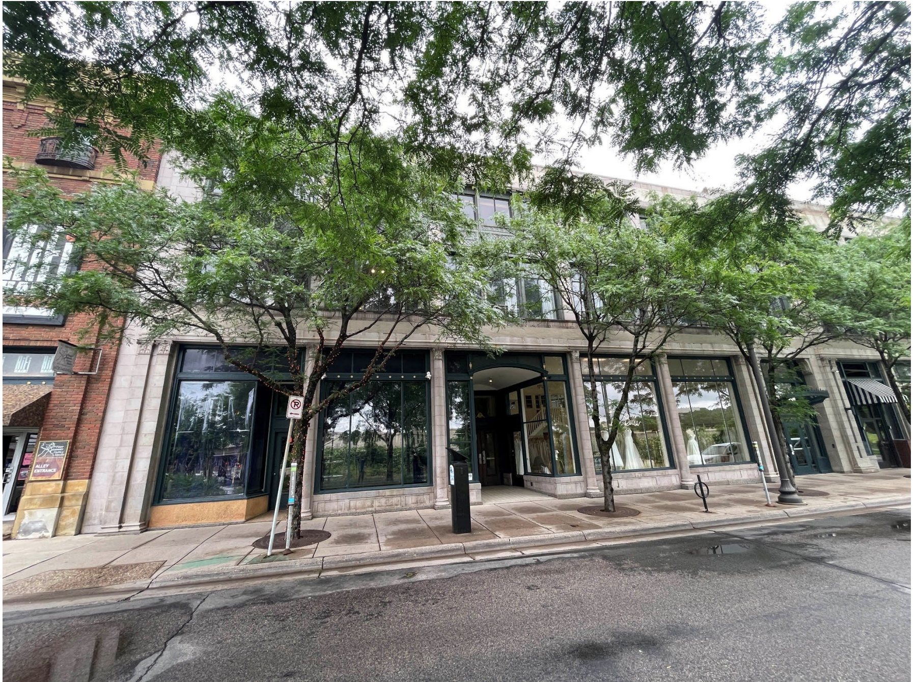
MN_Hennepin County_Fawkes Auto Complex_0004 West facade of 1635 Hennepin Ave, looking east.