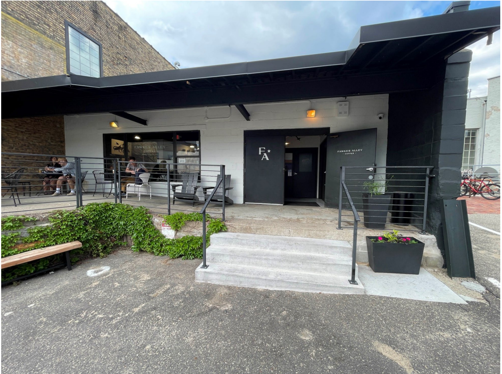
MN_Hennepin County_Fawkes Auto Complex_0029

East elevation of 1621 Hennepin, photo taken from alley.