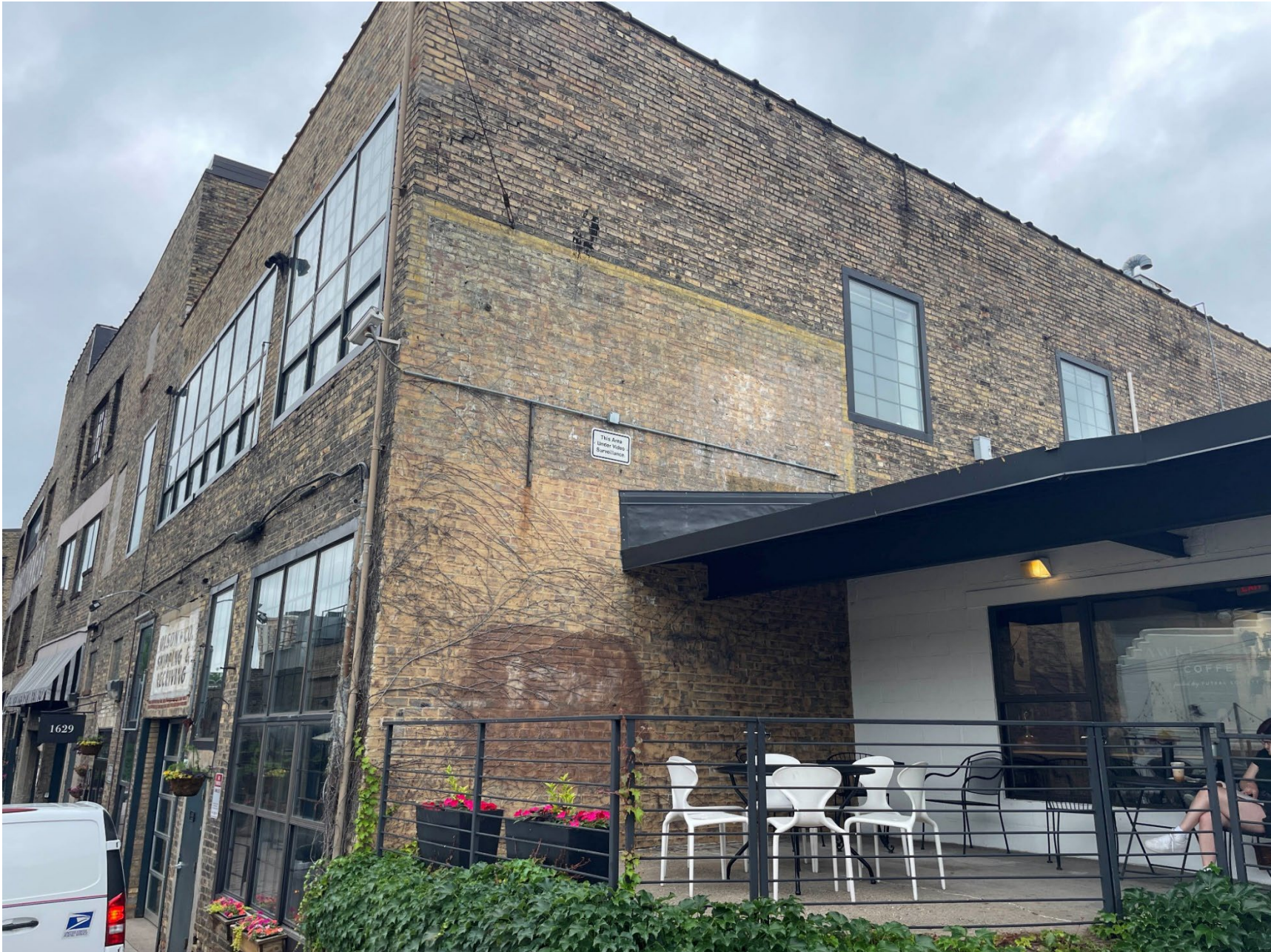
MN_Hennepin County_Fawkes Auto Complex_0025

Northeast corner elevation of 1625 Hennepin Ave, photo taken from alley.