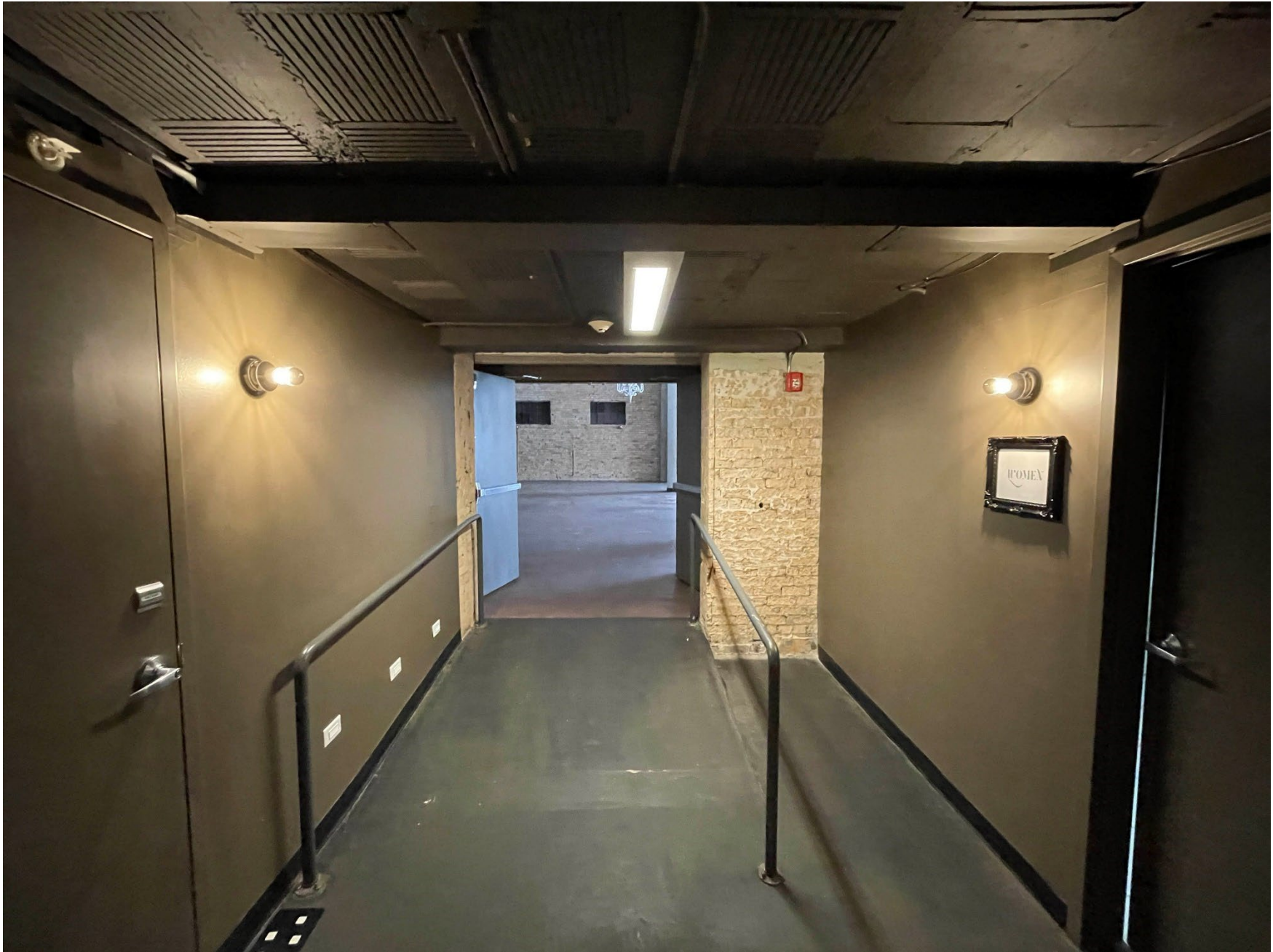
MN_Hennepin County_Fawkes Auto Complex_0015

First floor of 1629 Hennepin Ave, looking north at interior access to adjacent building located at 1625 Hennepin Ave.