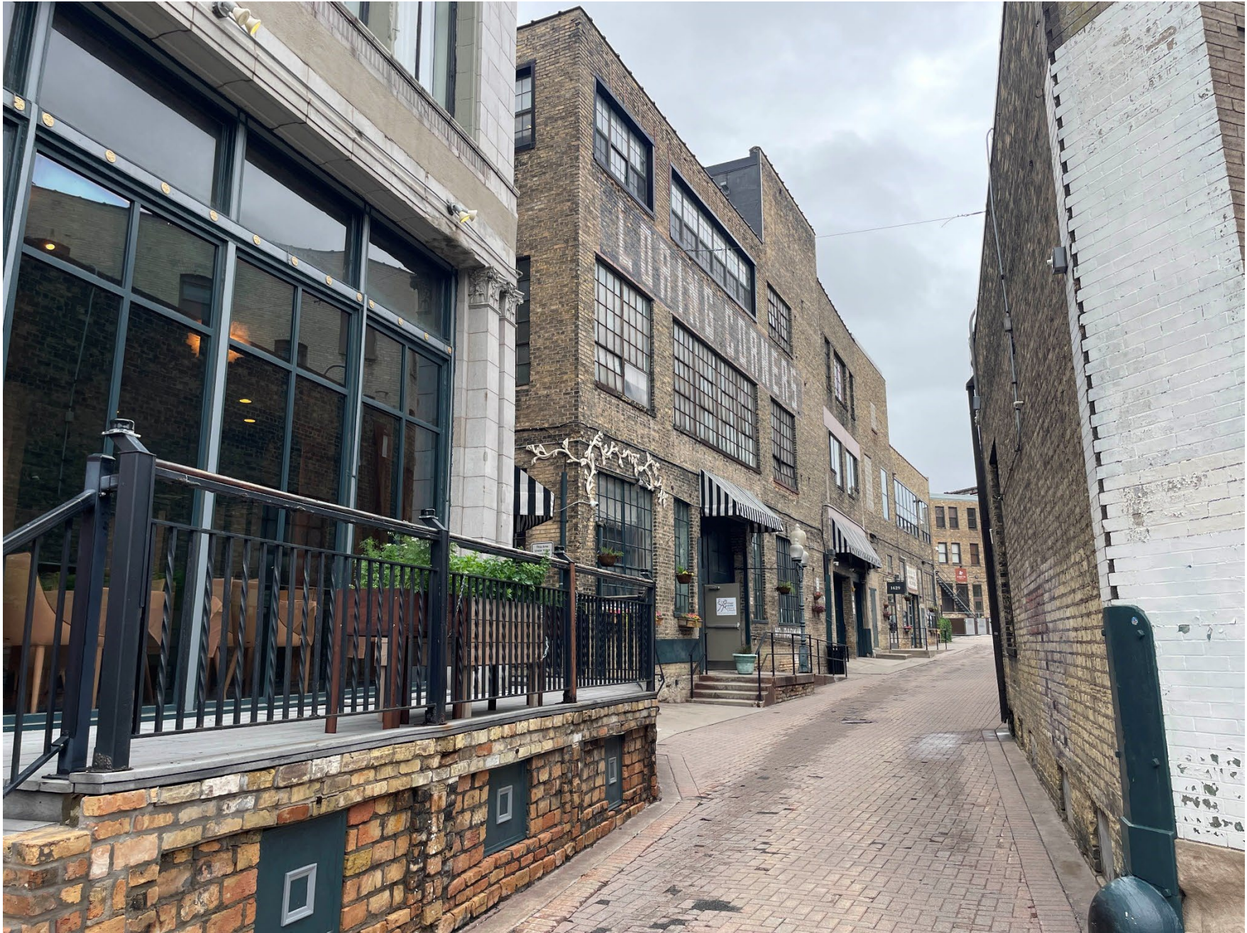
MN_Hennepin County_Fawkes Auto Complex_0011 Alley located behind 1621-635 Hennepin Ave, looking north.