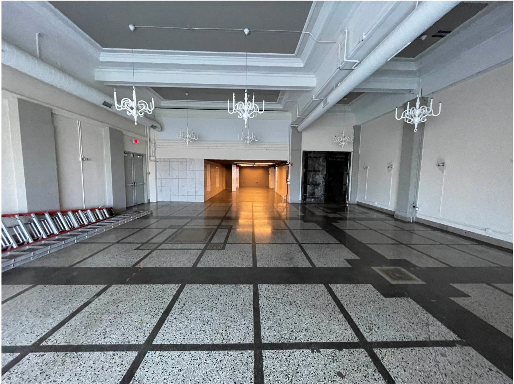
MN_Hennepin County_Fawkes Auto Complex_0016