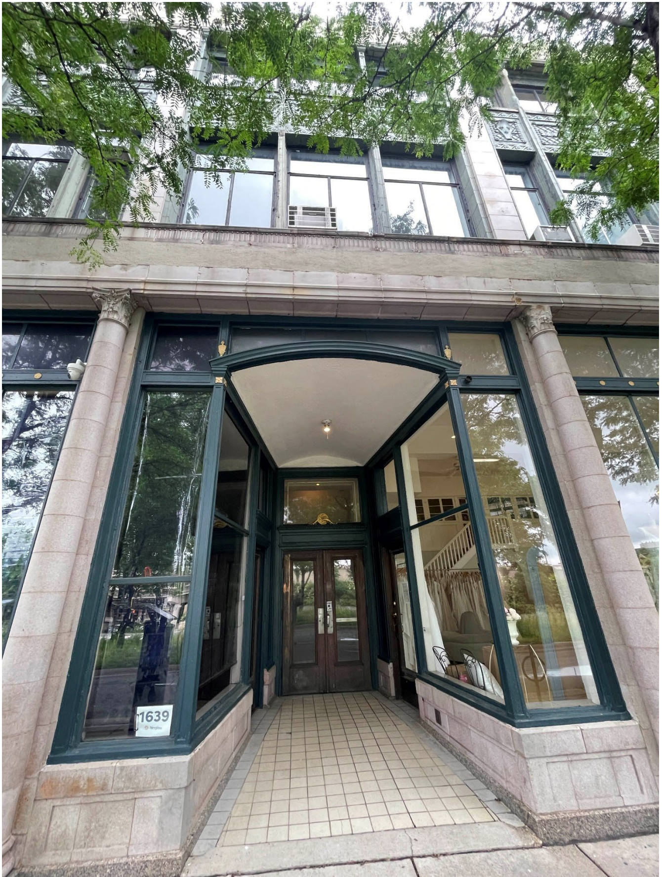
MN_Hennepin County_Fawkes Auto Complex_0005 West facade of 1635 Hennepin Ave, looking at recessed front entrance.