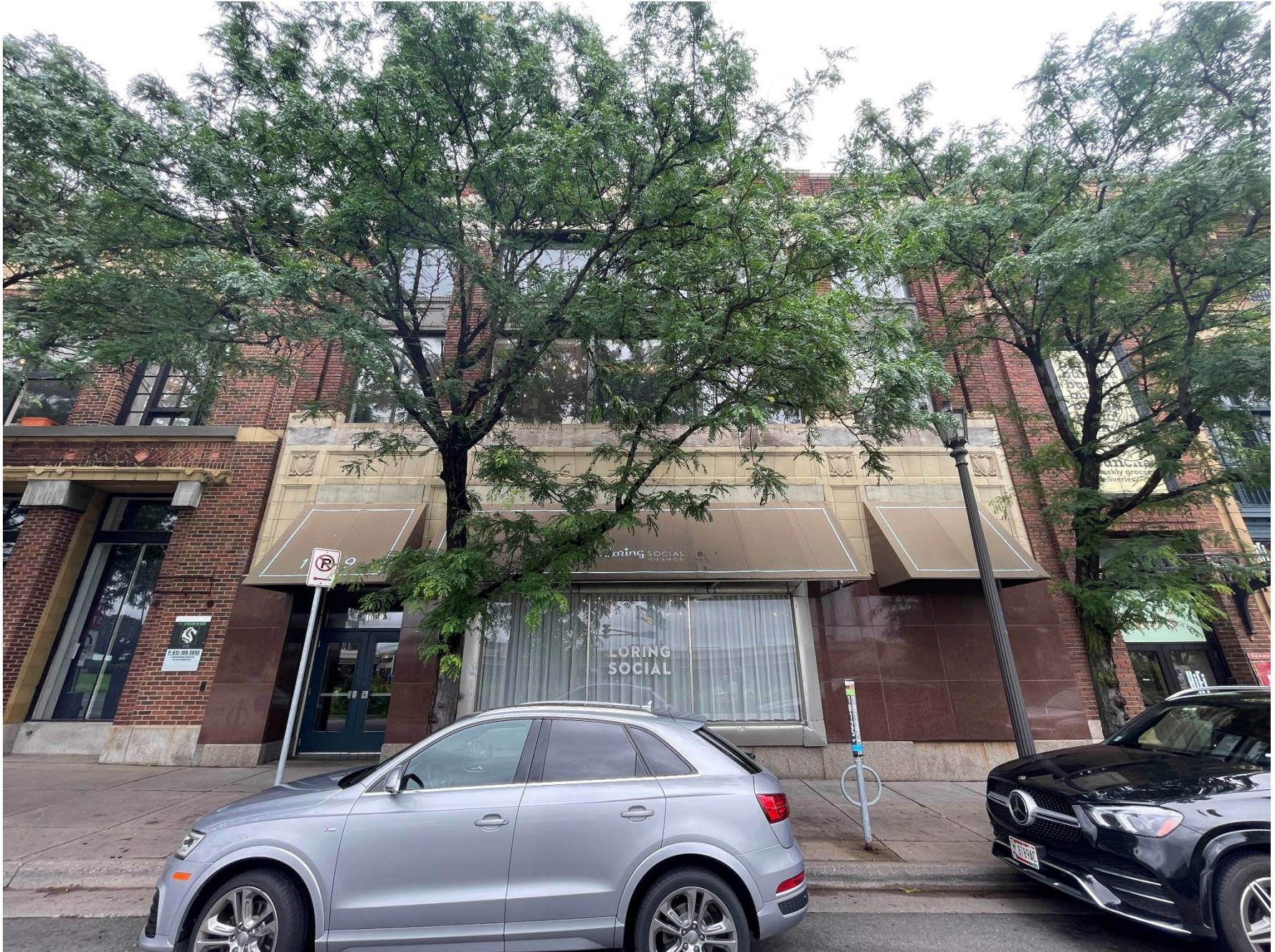
MN_Hennepin County_Fawkes Auto Complex_0002 West elevation of 1629 Hennepin Ave, looking east.