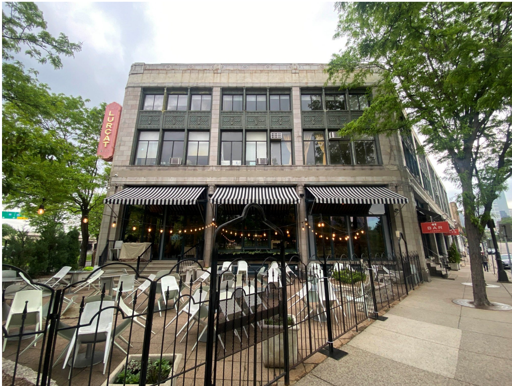
MN_Hennepin County_Fawkes Auto Complex_0008 South elevation of 1635 Hennepin Ave, looking north.