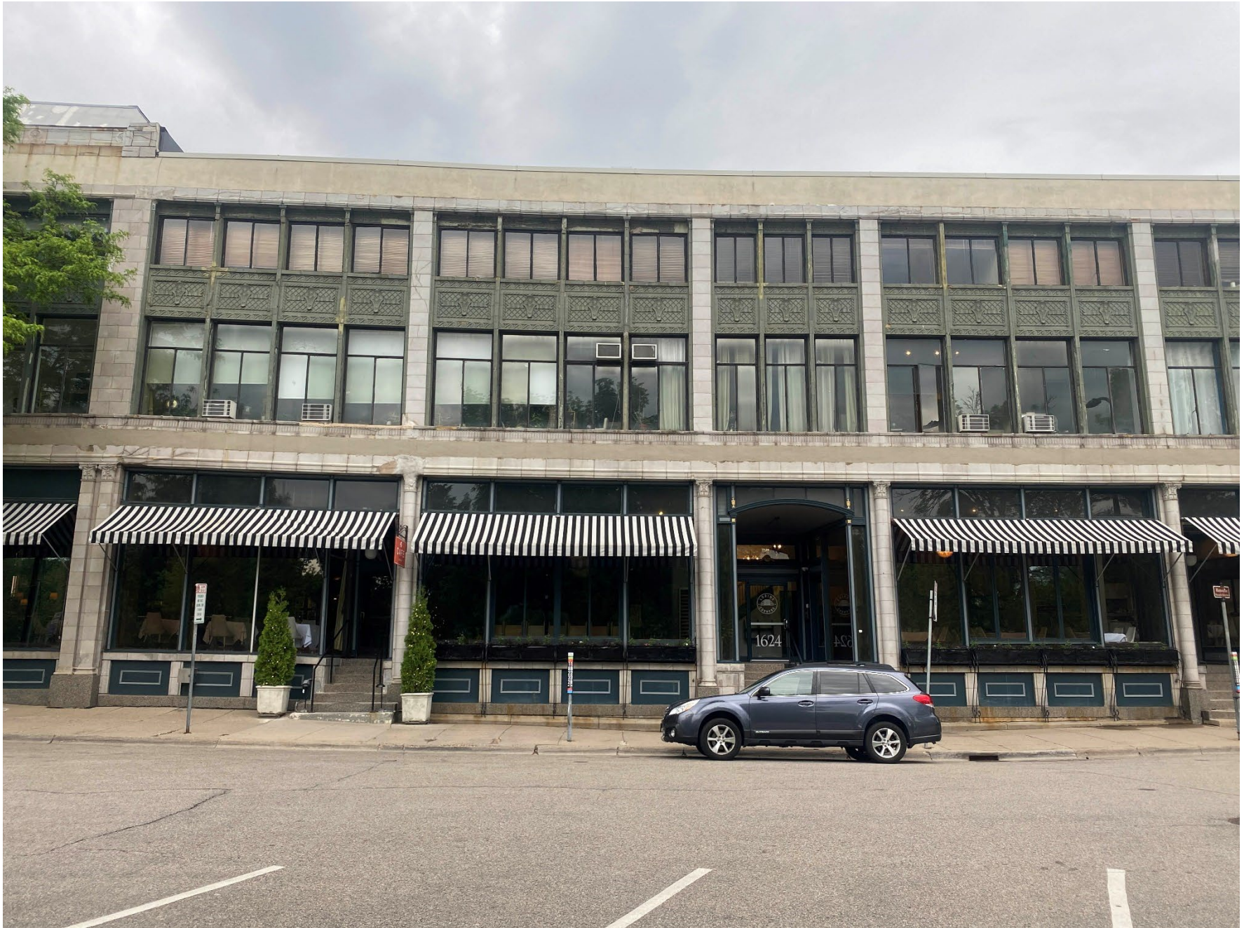
MN_Hennepin County_Fawkes Auto Complex_0009 Southeast elevation of 1635 Hennepin Ave, looking north.