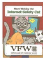
Child ID Kit, Fire Prevention, Home Security, Safety Tip Cards