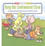
Keep Our Environment Clean Coloring Book